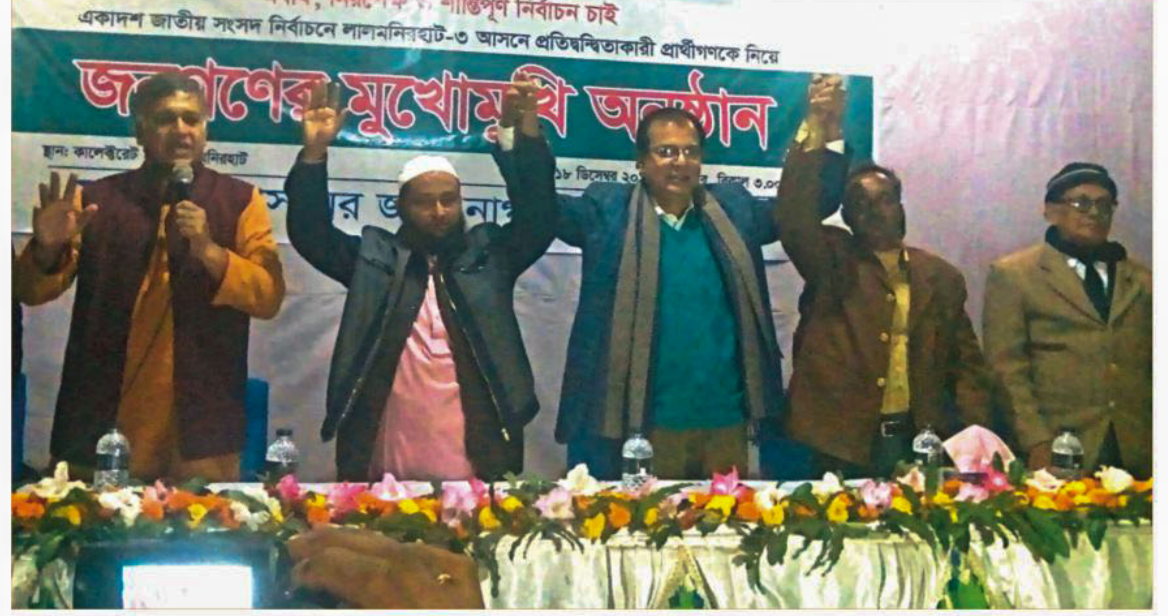
Three MP aspirants for Lalmonirhat-3 constituency promise to fight against crime and corruption during a 'Face to Face with People' programme, organised by Sushashoner Jonno Nagorik (Sujan) at Lalmonirhat Zila Parishad Auditorium on Tuesday.

Speaking on different issues, voters in Sadar upazila urged the candidates to be honest and remain friendly with people, if they are elected.