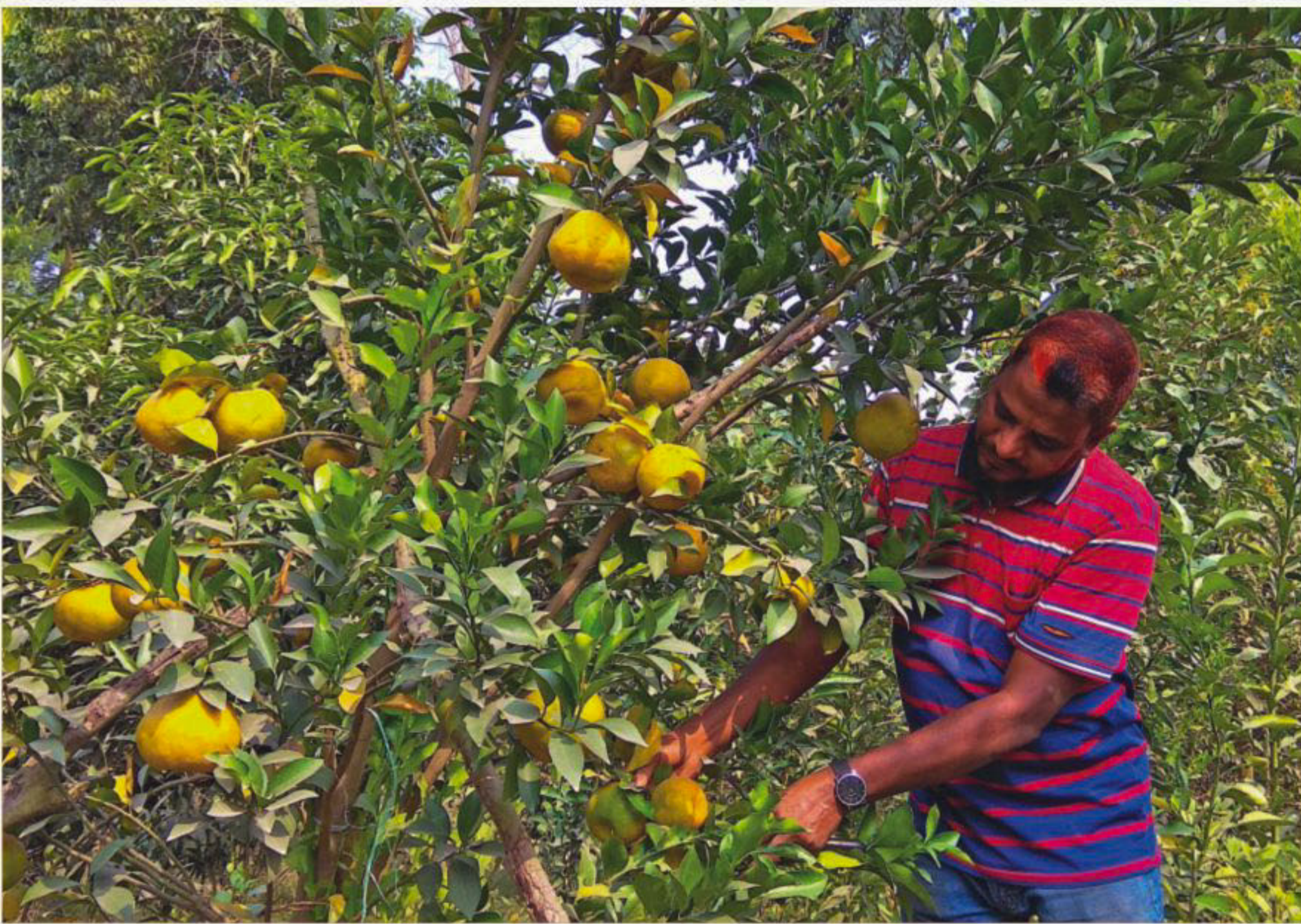
A farmer tends his orange orchard at Atahar in Chapainawabganj Sadar upazila as the popular fruit sees successful cultivation in the Barind area.

this year, and expects to earn around Tk 2 lakh. He planted 500 more saplings in his other orchard at Amnura.