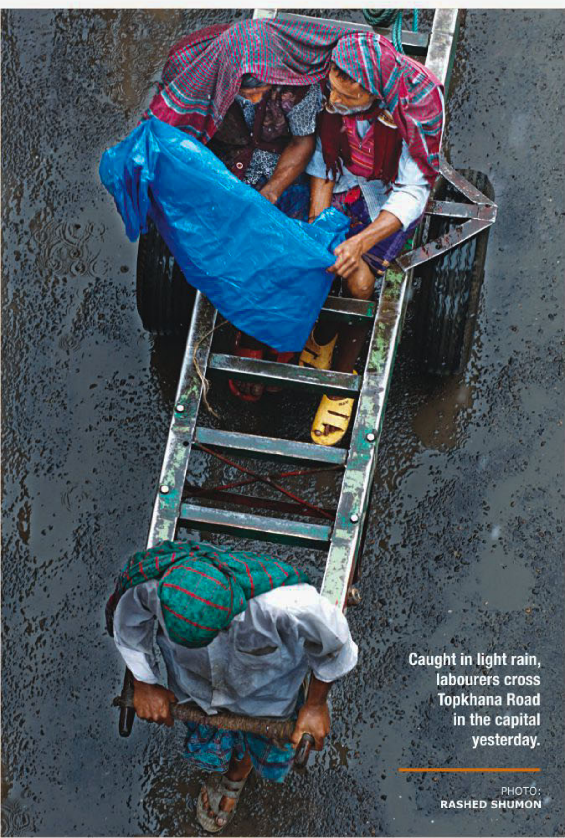
Caught in light rain, labourers cross Topkhana Road in the capital yesterday.