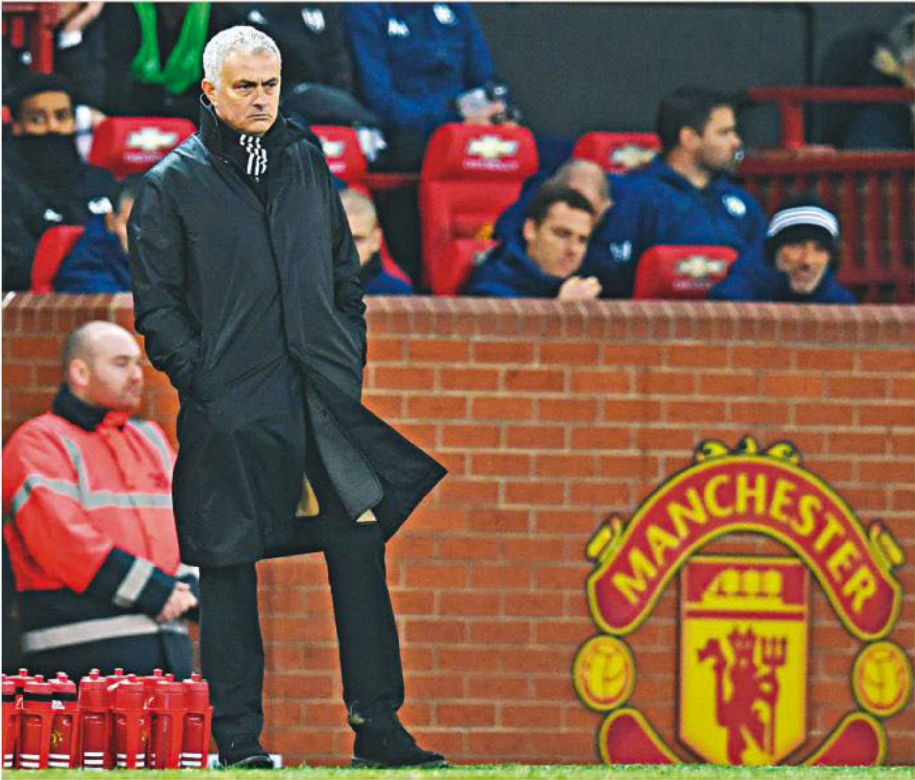
Jose Mourinho on the touchline was often a picture of gloom during his final few weeks as manager of Manchester United.

"Manchester United announces that manager Jose Mourinho has left the club with immediate effect," a club statement said. "The club would like to thank Jose for his work during his time at Manchester United and to wish him success in the future. A new caretaker manager will be appointed until the end of the current season, while the club conducts a thor-