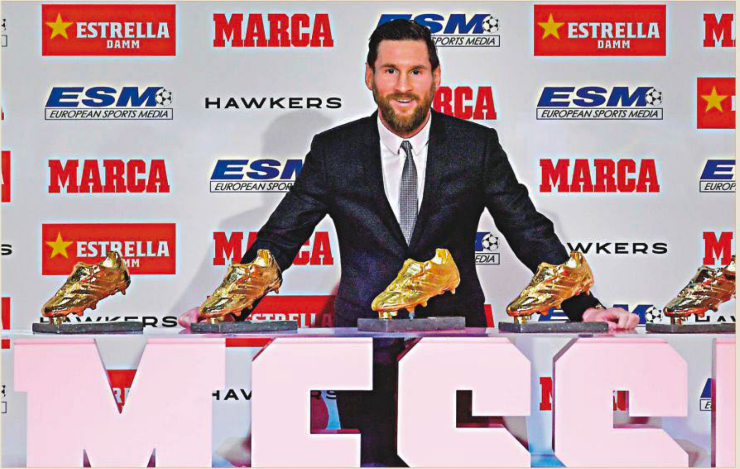
Lionel Messi collected a record fifth Golden Shoe award yesterday for finishing last season as the top goalscorer in Europe. The striker scored 34 goals in 68 games for Barcelona, putting him ahead of Liverpool's Mohamed Salah and Tottenham's Harry Kane.

The England forward later issued a statement accusing the British media of fuelling racism in the way it reports certain stories about black players. Chelsea banned four supporters pending an