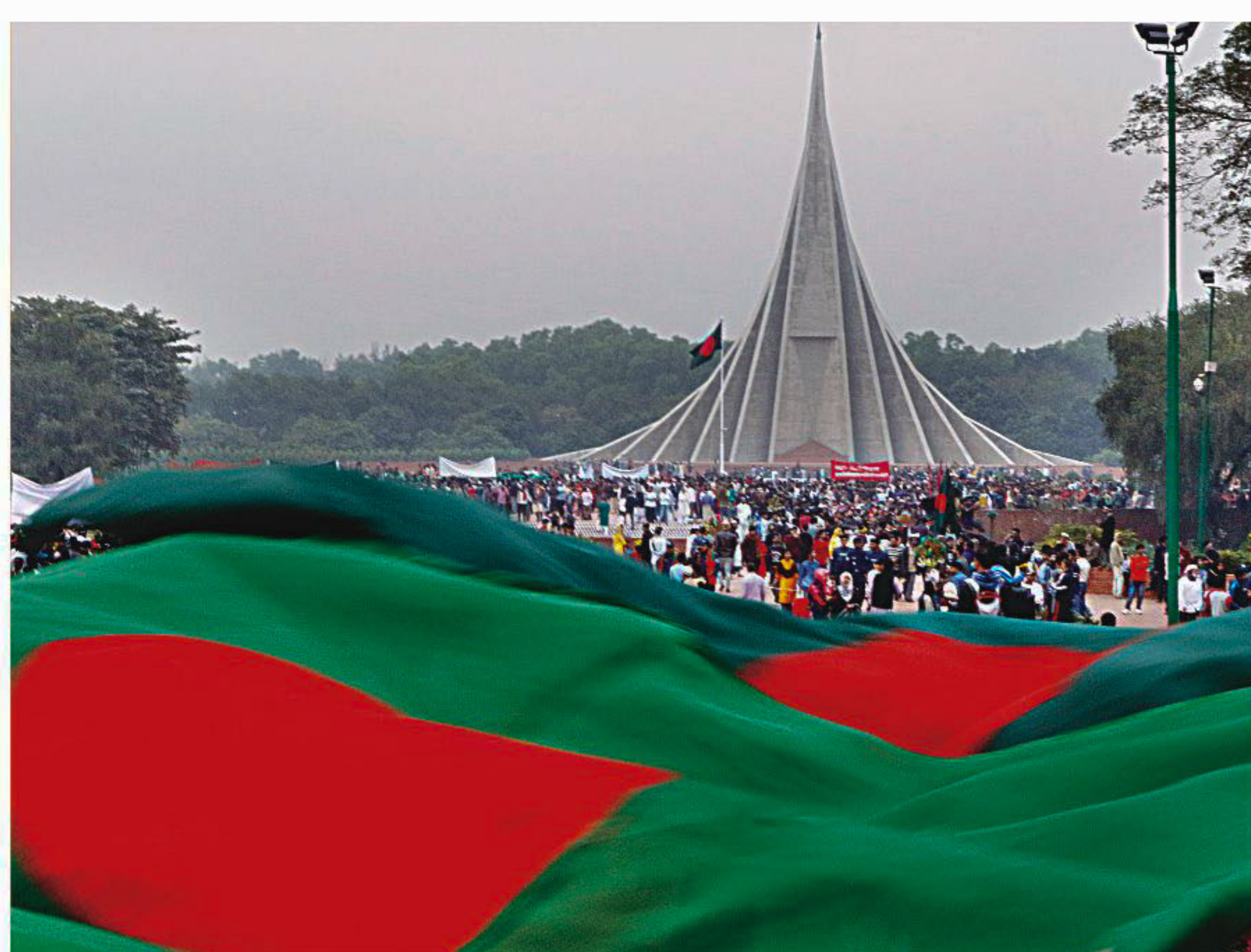
The waves of red-green adorn the National Martyrs' Memorial in Savar as thousands gather to place wreaths there on the 48th Victory Day yesterday. People from all walks of life paid tribute to the martyrs who laid down their lives for the independence of this country.