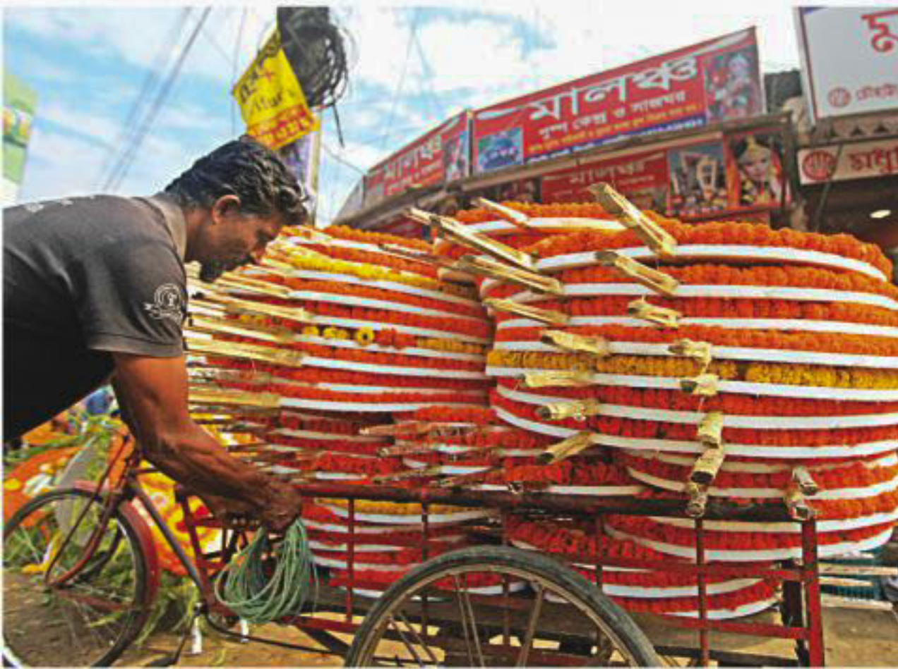
Florists busy making wreaths as hundreds of orders were placed ahead of Victory Day. While many are ready for delivery, others are on the way to buyers' places. Traders said 10 flower shops in Sylhet city have received more than 2,000 orders. Each wreath is sold for Tk 500-2,000 based on quality and size. The photos were taken at Chowhatta Point yesterday.