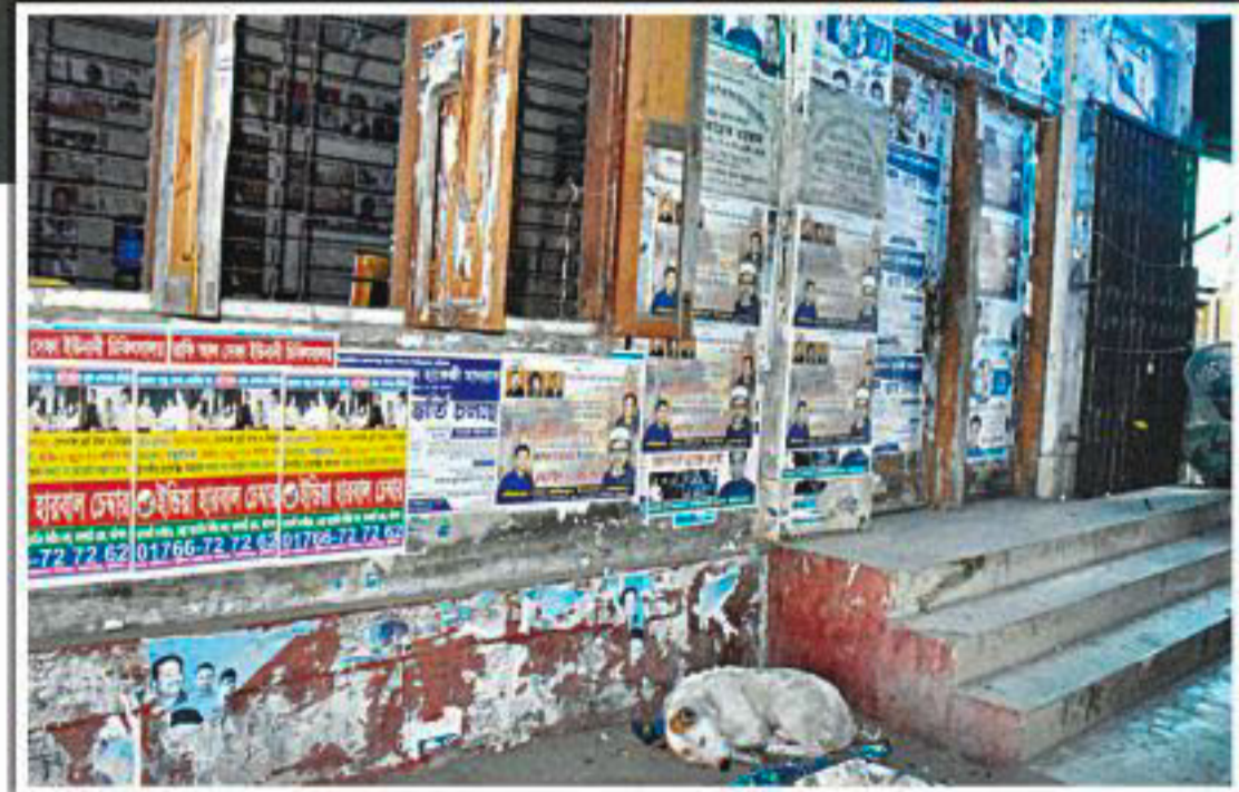
The Awami League office in Barishal looks almost deserted while the BNP office in the city, inset , is locked. Election campaign in Barishal city by the two major parties has not yet gained momentum although the national election is just two weeks away. The photos were taken around 6:00pm yesterday.