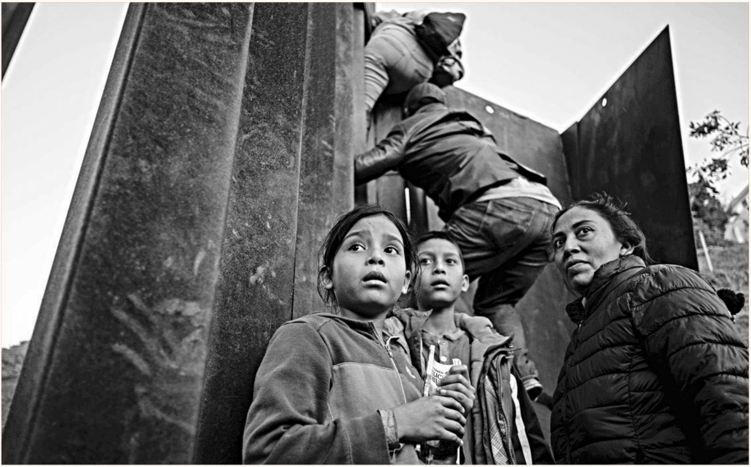
Central American migrants travelling in a caravan, hesitate as others climb the Mexico-US border fence in an attempt to cross to San Diego County, in Playas de Tijuana, Baja California state, Mexico on Wednesday. Thousands of Central American migrants have trekked for over a month in the hopes of reaching the United States.