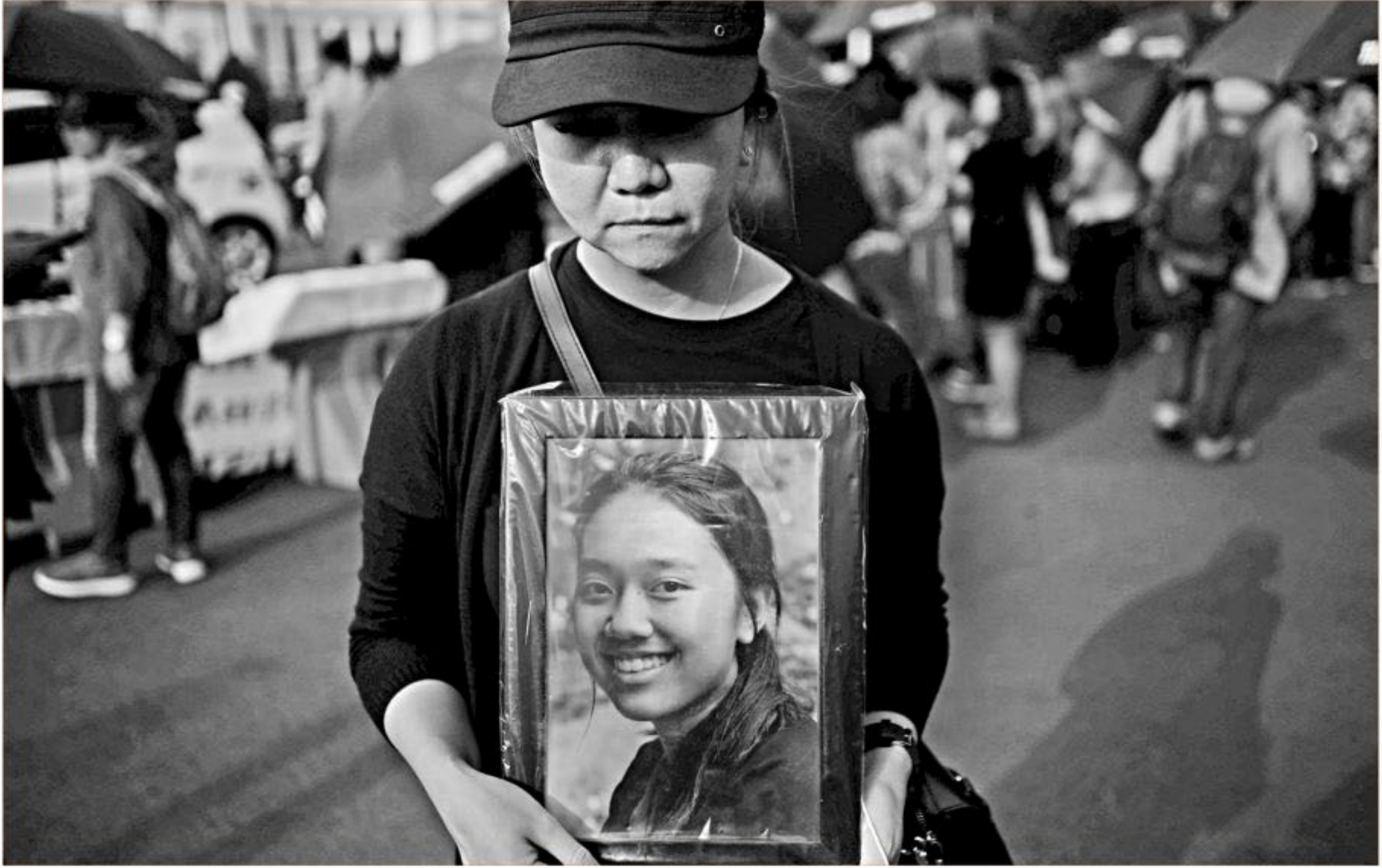
A woman holds a portrait picture of a relative, one of the 189 people killed in a Lion Air plane crash, during a rally calling for Lion Air to put safety over profit and for Indonesian President Joko Widodo to ensure all remains were recovered, in Jakarta, Indonesia yesterday.