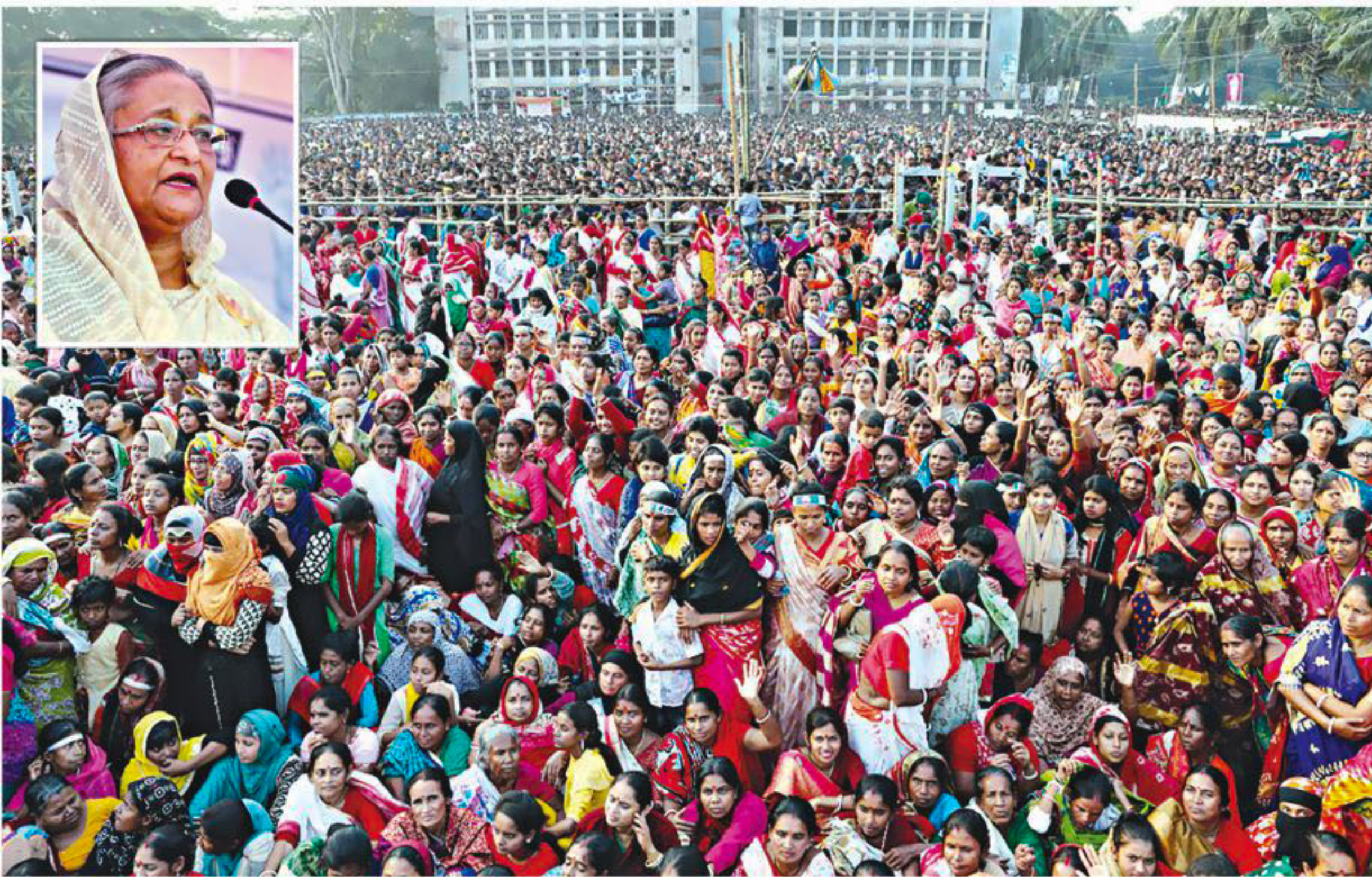
Prime Minister Sheikh Hasina addresses an enormous rally on Sheikh Lutful Rahman Government College premises in Gopalganj's Kotalipara yesterday as she embarks on the campaign trail.