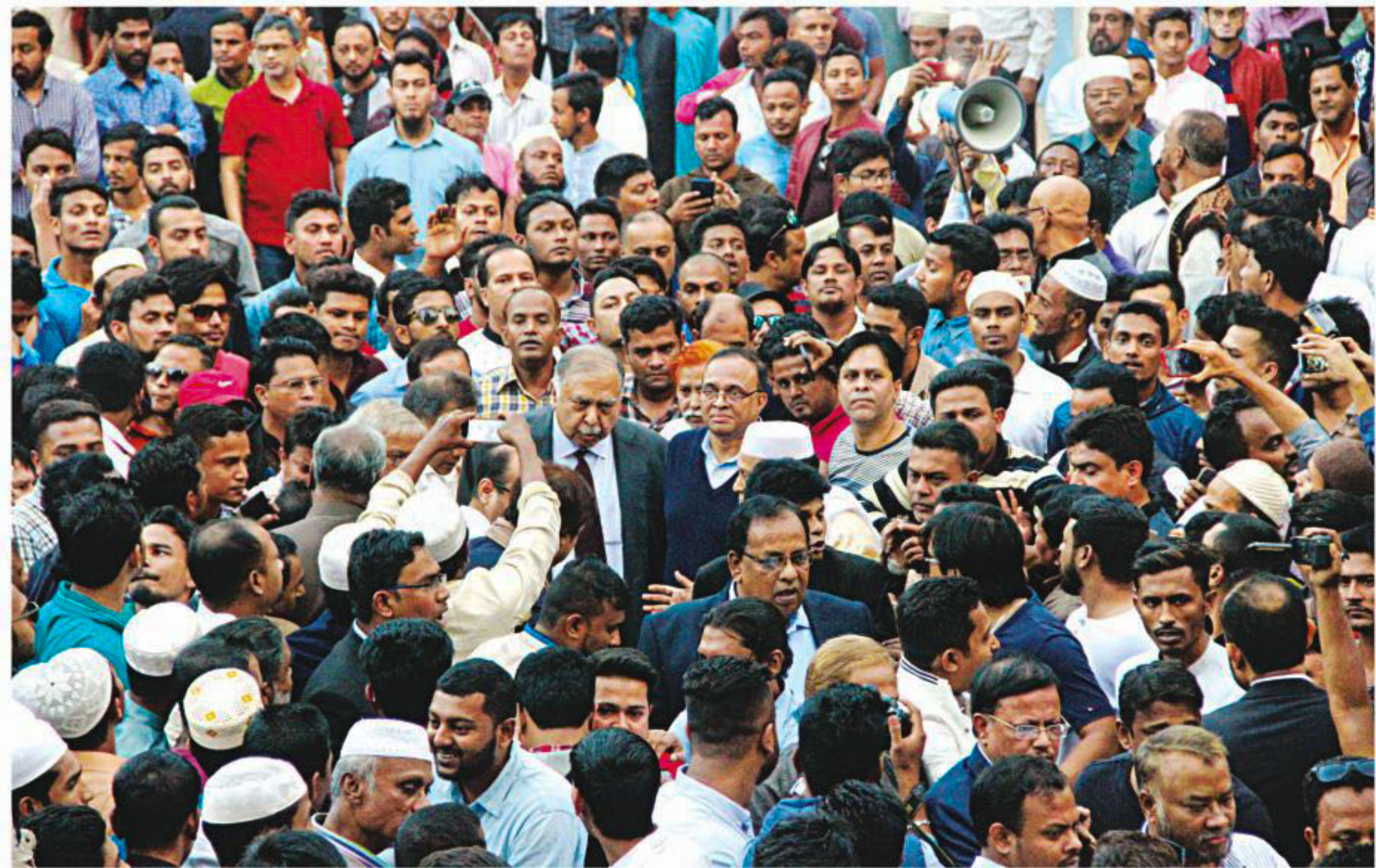
A crowd of journalists and party leaders swarm around Dr Kamal Hossain as he launches Jatiya Oikyafront's election campaign at the shrine of Hazrat Shahjalal in Sylhet yesterday.