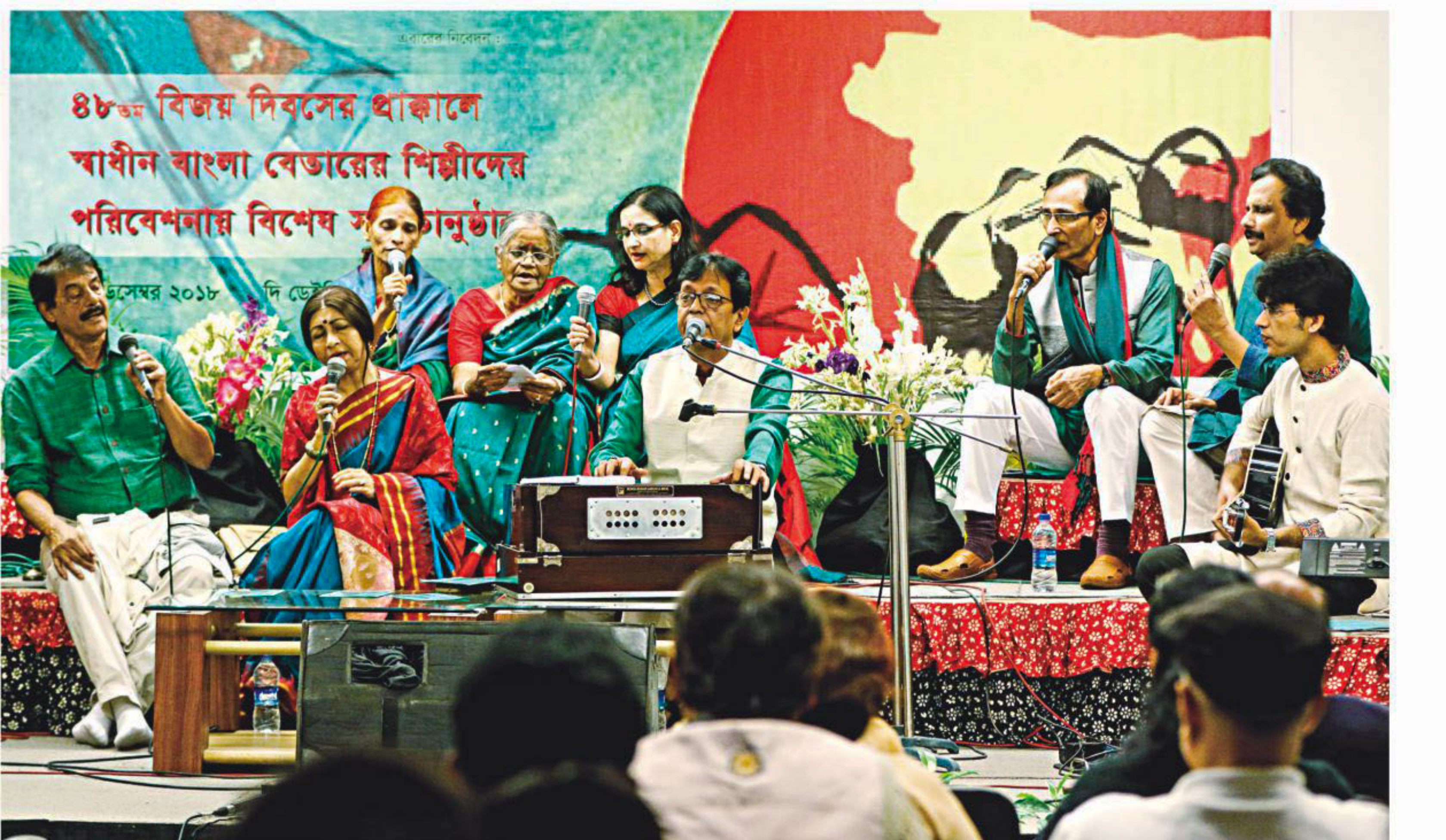
Prominent artistes from Swadhin Bangla Betar Kendra perform at the event.