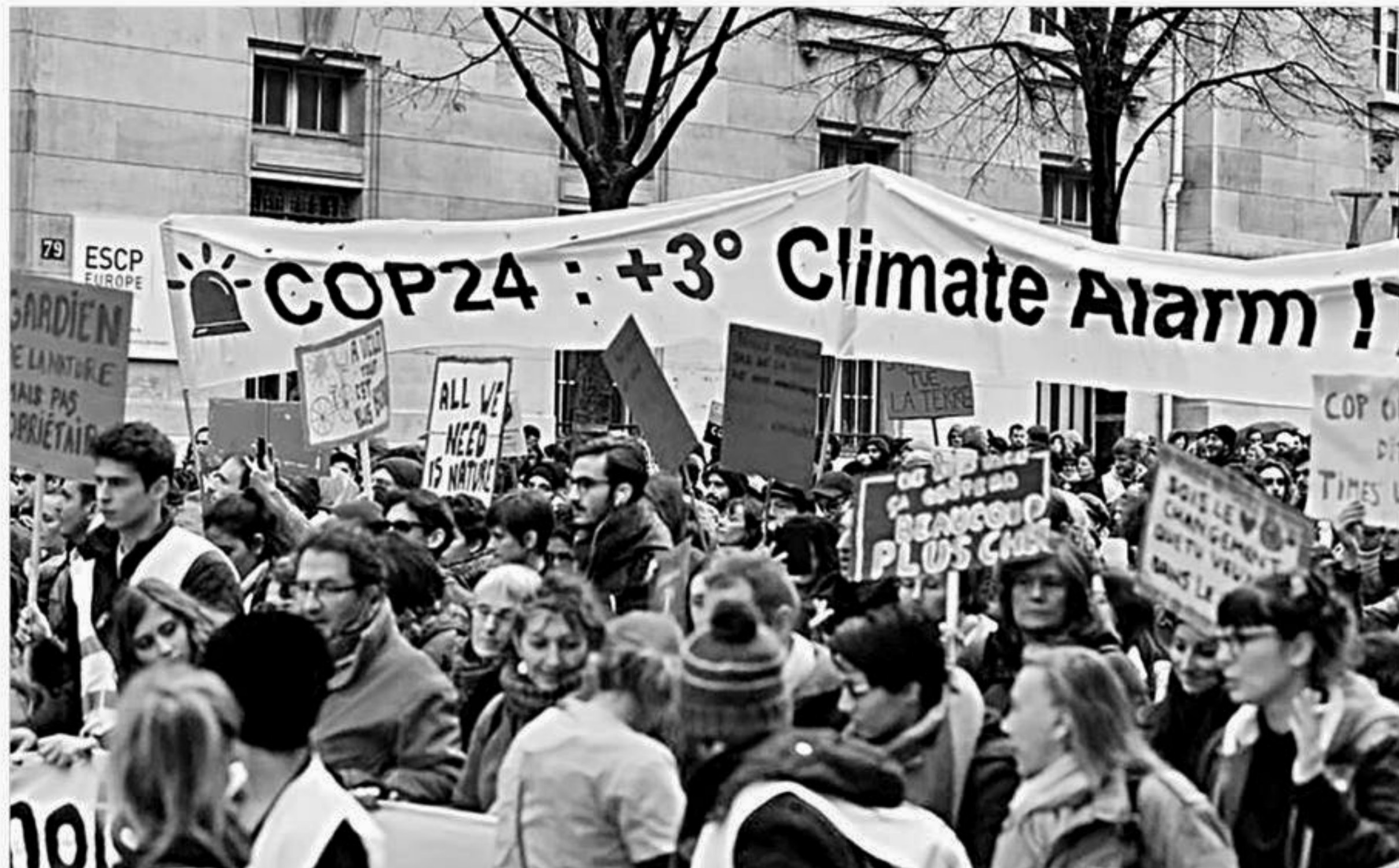
People attend a demonstration to urge politicians to act against climate change in Paris, France, as the COP24 is held in Poland, December 8, 2018.

and companies and universities. This second pavilion has the slogan of "we are still in" the Paris Agreement. It is one of the most popular pavilions at the COP! On the other hand the official Trump delegation is holding a special event to promote coal as the future which has been paid for by the coal industry in the US. Many countries are asking why Trump has even bothered to send a delegation to the COP if he wants to leave the Paris Agreement? The answer is that he doesn't just want to leave it but rather to prevent other countries from making progress. In this goal he has gained the support of Saudi Arabia and Russia (which is really a trio who are becoming a major global partnership on more than climate change).