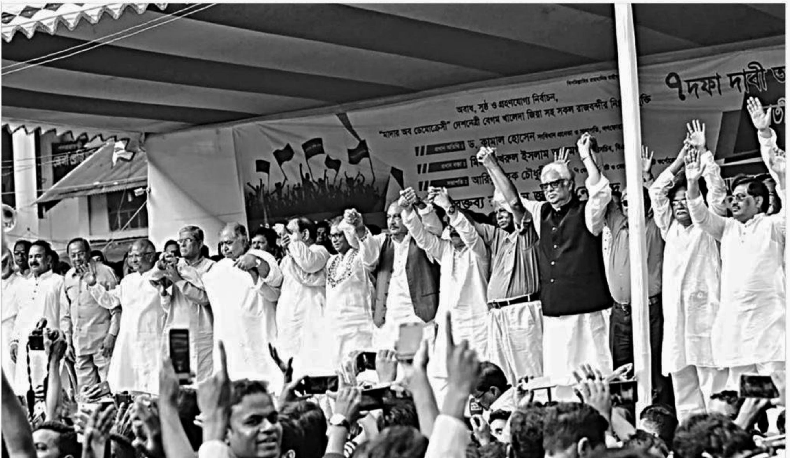
Jatiya Oikyafront leaders join hands on the rally stage at Sylhet Registrar's Office ground in October 2018. The emergence of the coalition, headed by Dr Kamal Hossain, has brought a sea-change in the political landscape.

It is obvious that none of these directives have been taken seriously, leaving young girls vulnerable to the whims of these psychopaths. If we really did have separate cells in police departments to monitor stalking, if stalkers were given exemplary punishment, if the police (including higher officials) seriously went after stalkers and took action, how many of these girls would have been saved? Stalking as we all know, usually happens over a period of time, which means it is not difficult to identify the stalker. So why are we not stopping the crime before it escalates into a fatal attack on a helpless young girl or woman? The government has a huge responsibility to implement the HC directives and protect young girls, whether they are at school, on the streets or at home, from these predators.