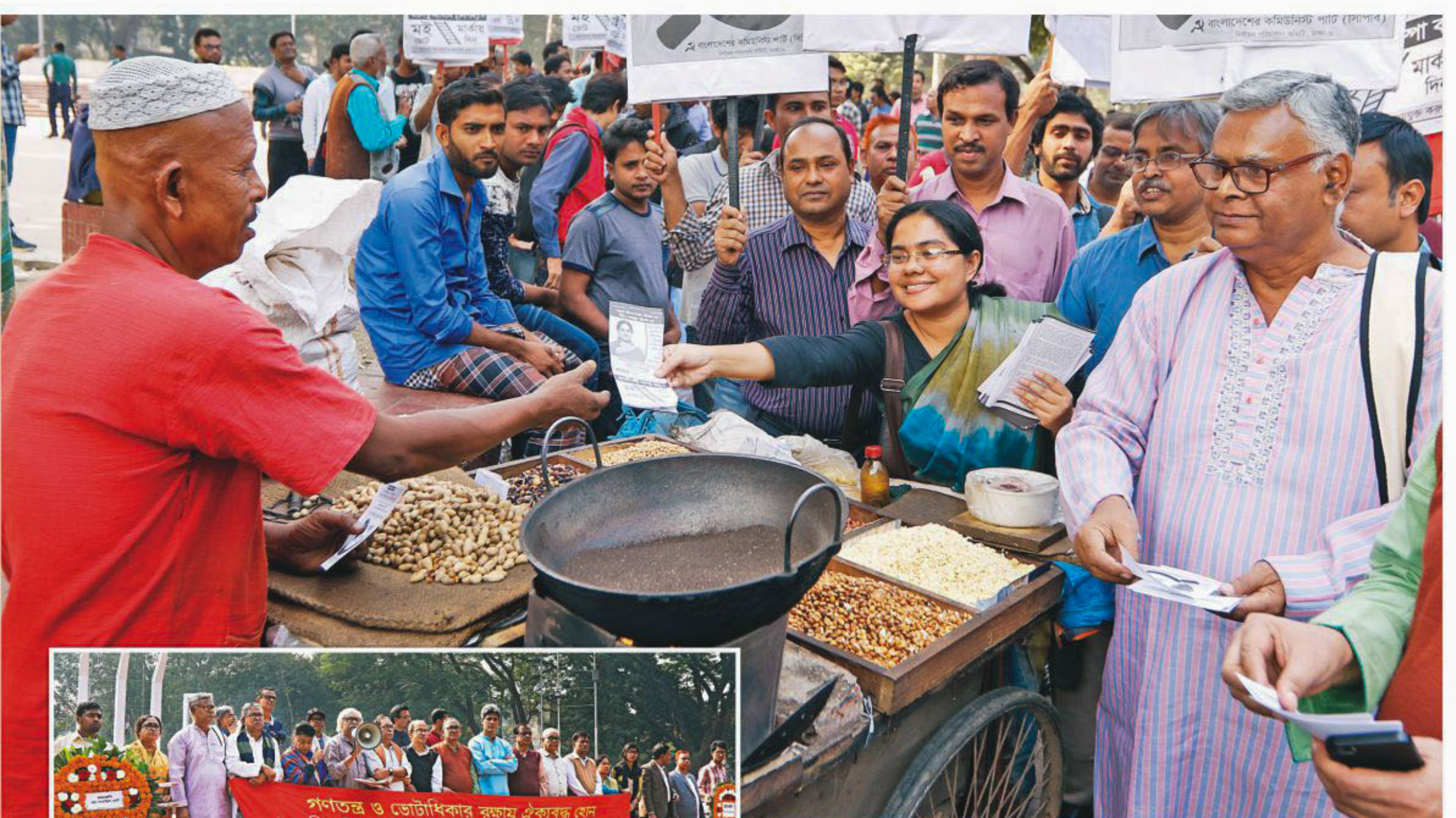
Campaigners of Left Democratic Alliance distribute leaflets among prospective voters, seeking support for their candidates in the national polls, after placing wreaths at the Central Shaheed Minar, inset, to start their campaign.

Meanwhile, in a press release, LDA said its election manifesto will be announced at a press conference at Mukti Bhavan in the capital's Purana Paltan today.