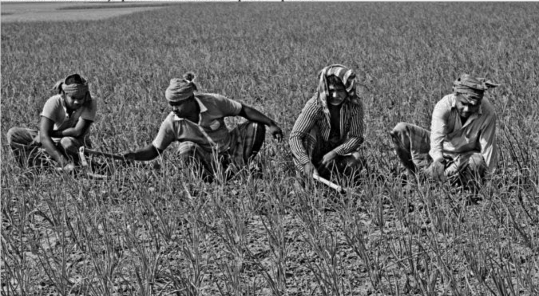
Labourers are seen harvesting onion from a field at Baruli village in Baliakandi upazila of Rajbari.