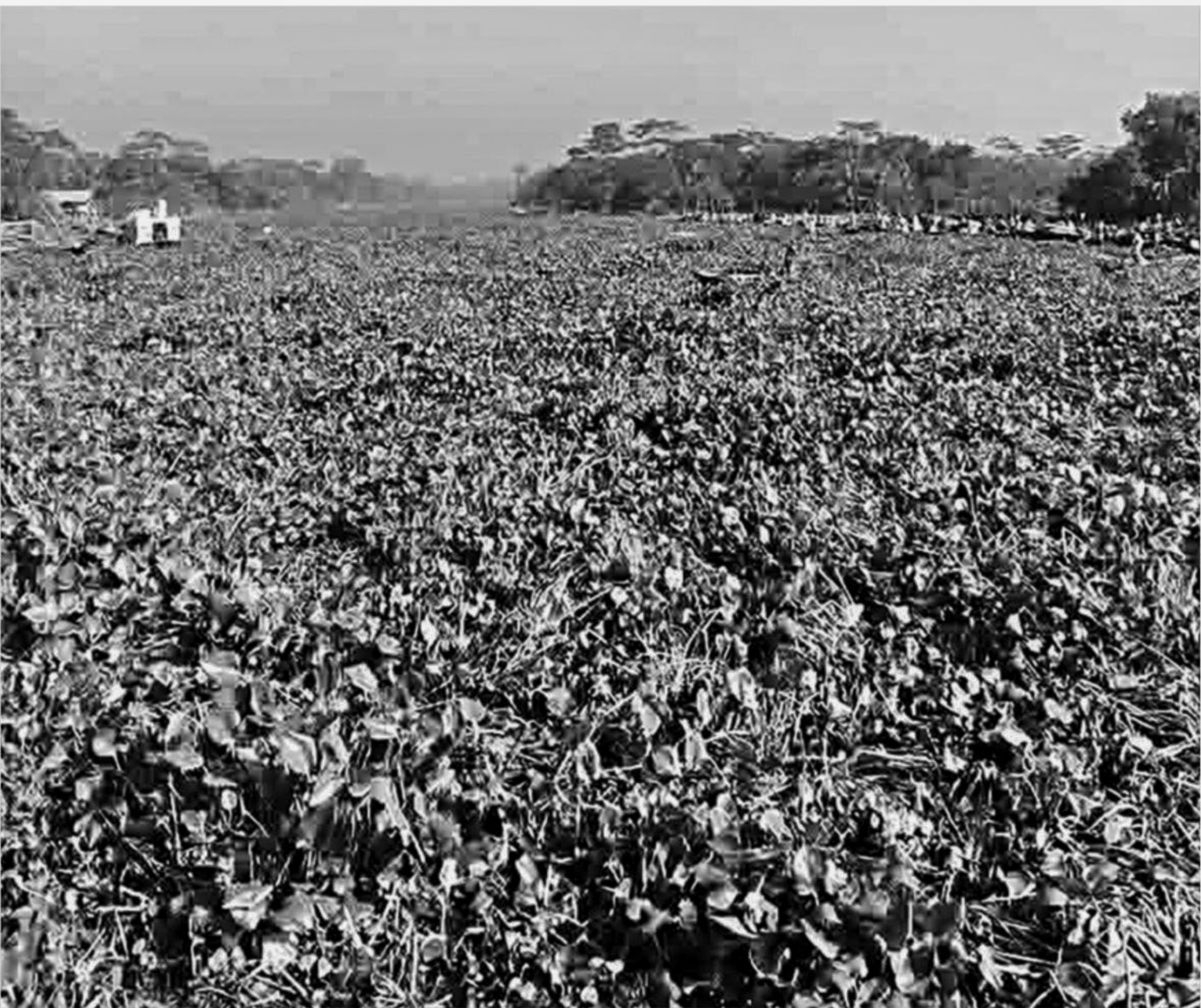
Water hyacinth stretches out as far as the eye can see on the Belua river in Boithakata Bazar area under Nazirpur upazila of Pirojpur.