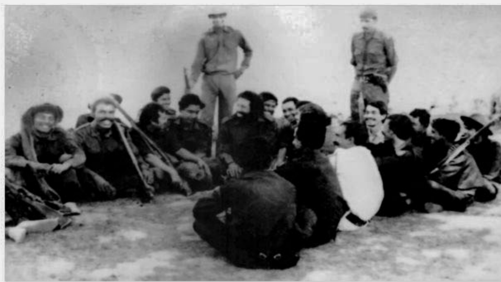
A file photo shows freedom fighters belonging to Kaderia Bahini, named after its valiant commander Abdul Kader Siddiqui, at a camp in Tangail days before the district was freed from the Pakistan occupation forces on December 10 in 1971.

directed by Khandakar Abdul Baten, also attacked the occupation forces.