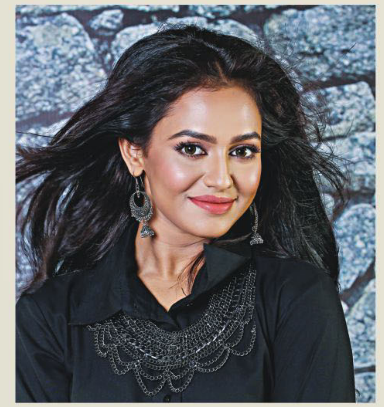
Nusraat Faria