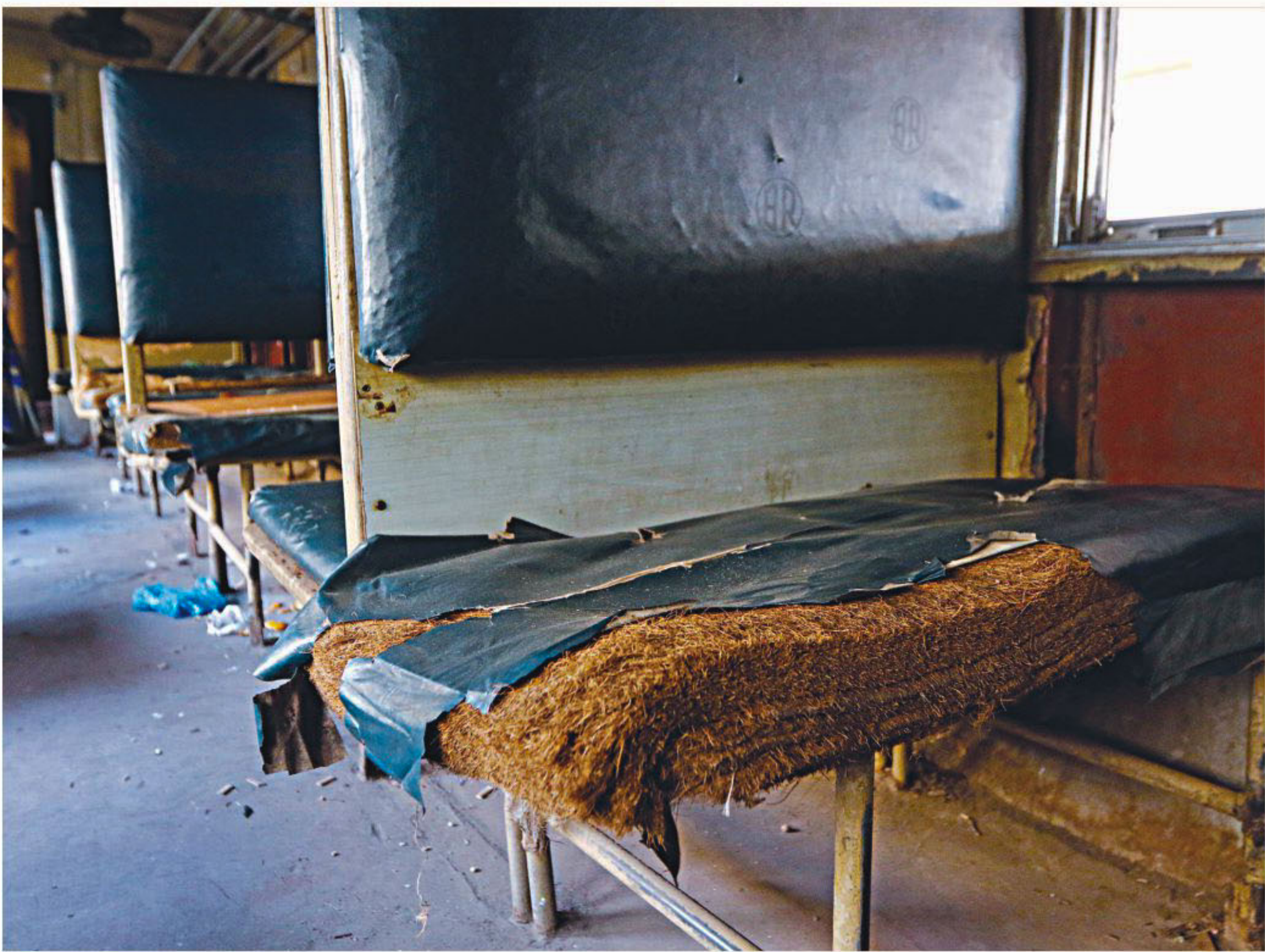
Bangladesh Railway is celebrating Service Week on the seventh anniversary of the establishment of the Ministry of Railways. However, a brief tour of the Kamalapur Railway Station presents a grim picture of the "service". Carriages had ripped seats, broken walls, and rubbish all around. The photos were taken on Wednesday, the second day of the Service Week.