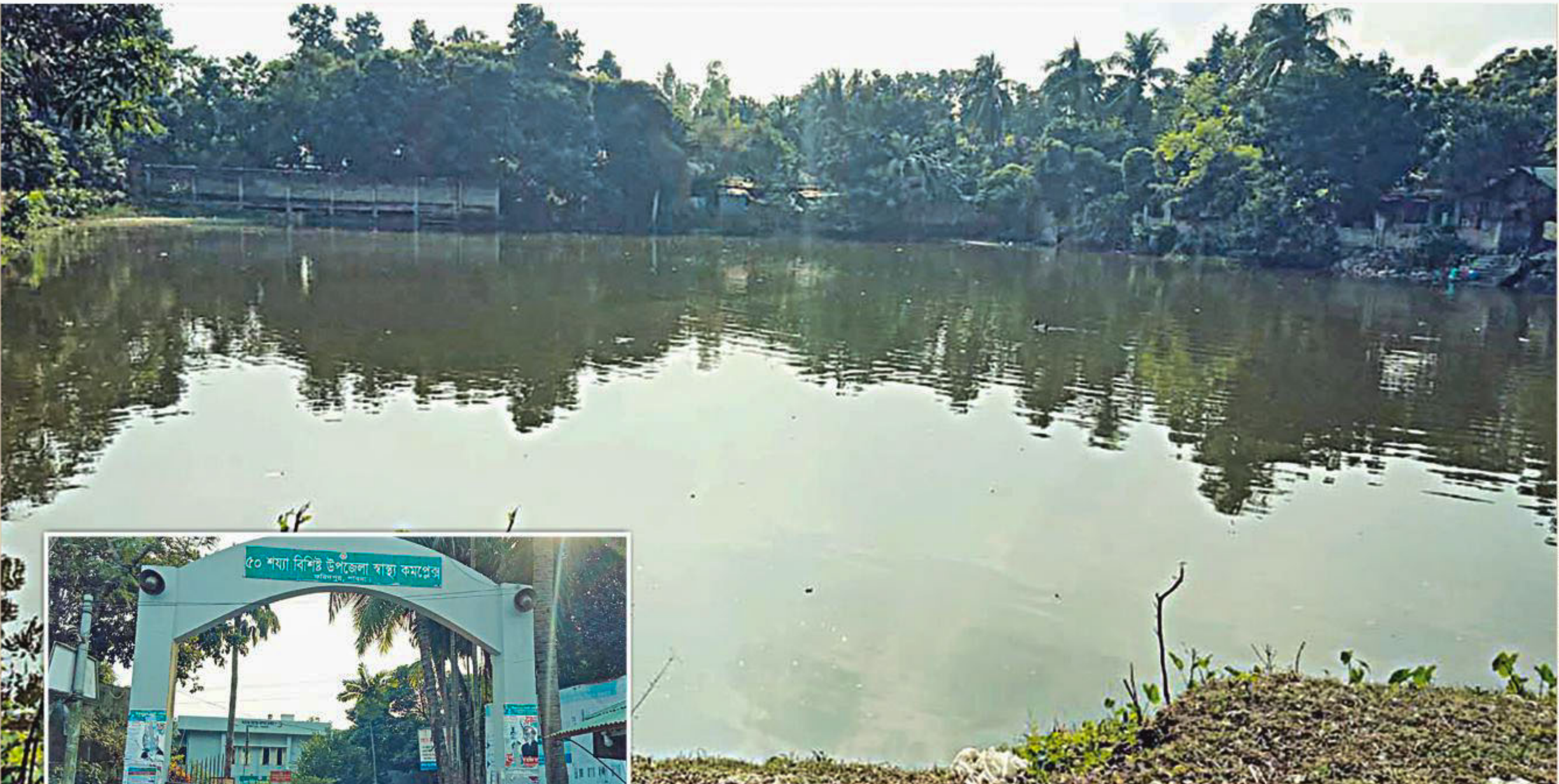
This large pond at Faridpur Upazila Health Complex compound carries the fading memory of legendary composer Gauri Prasanna Mazumder. Inset, the 50-bed hospital was built on the ancestral property of the famous lyricist in Pabna's Faridpur upazila.