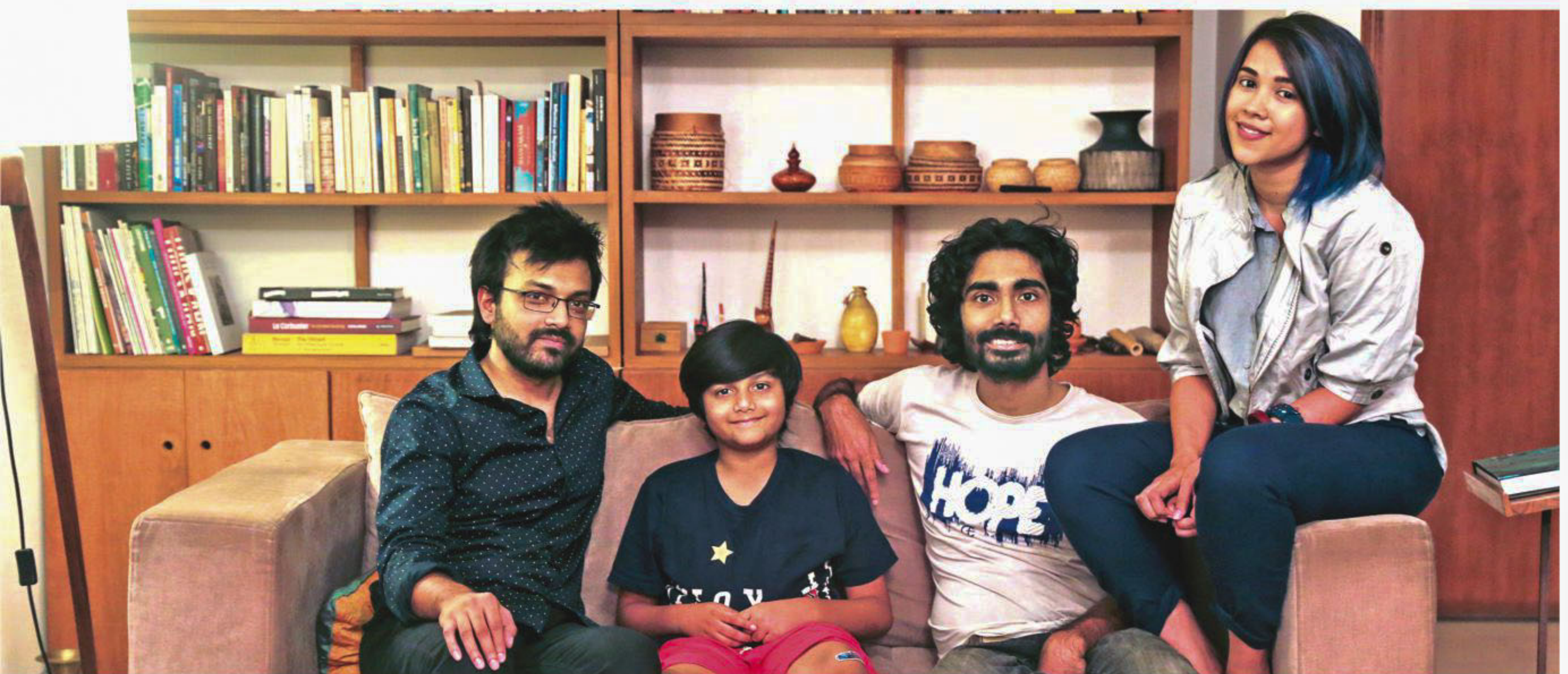
The cast and crew of 'Project Omni'.