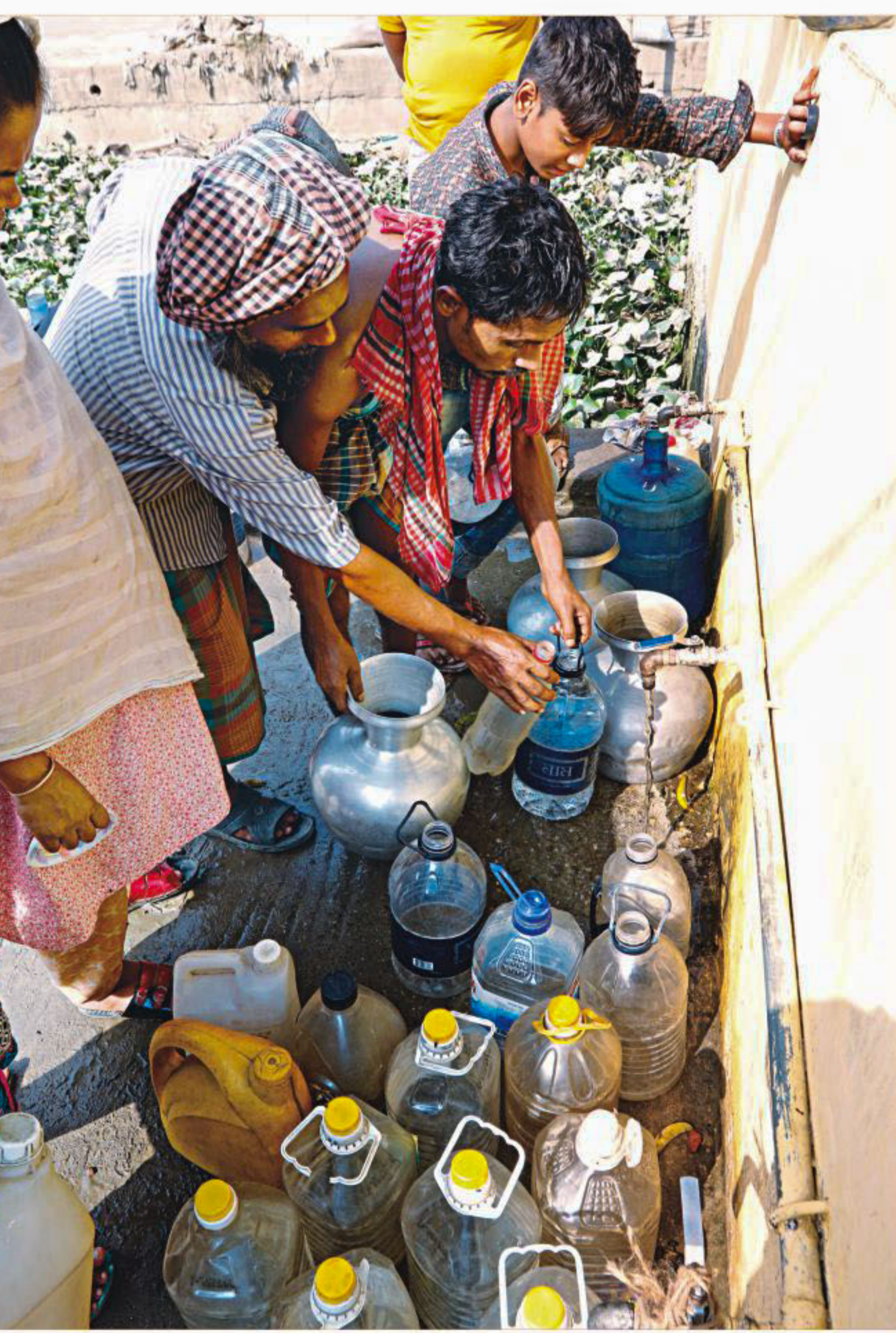
Residents of Purba Dolairpar gather at a WASA pump to collect fresh water after they started getting smelly water at home. The photo was taken on Saturday.