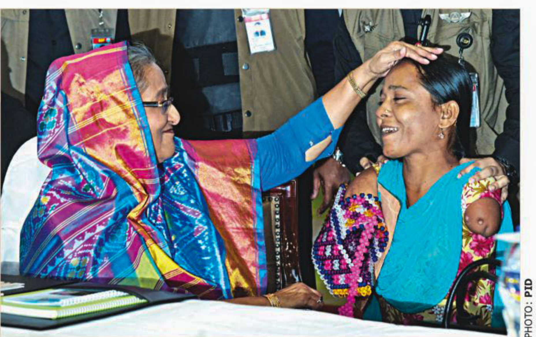
Prime Minister Sheikh Hasina speaks to a woman with physical disability during a programme at Bangabandhu International Conference Centre in Dhaka yesterday.