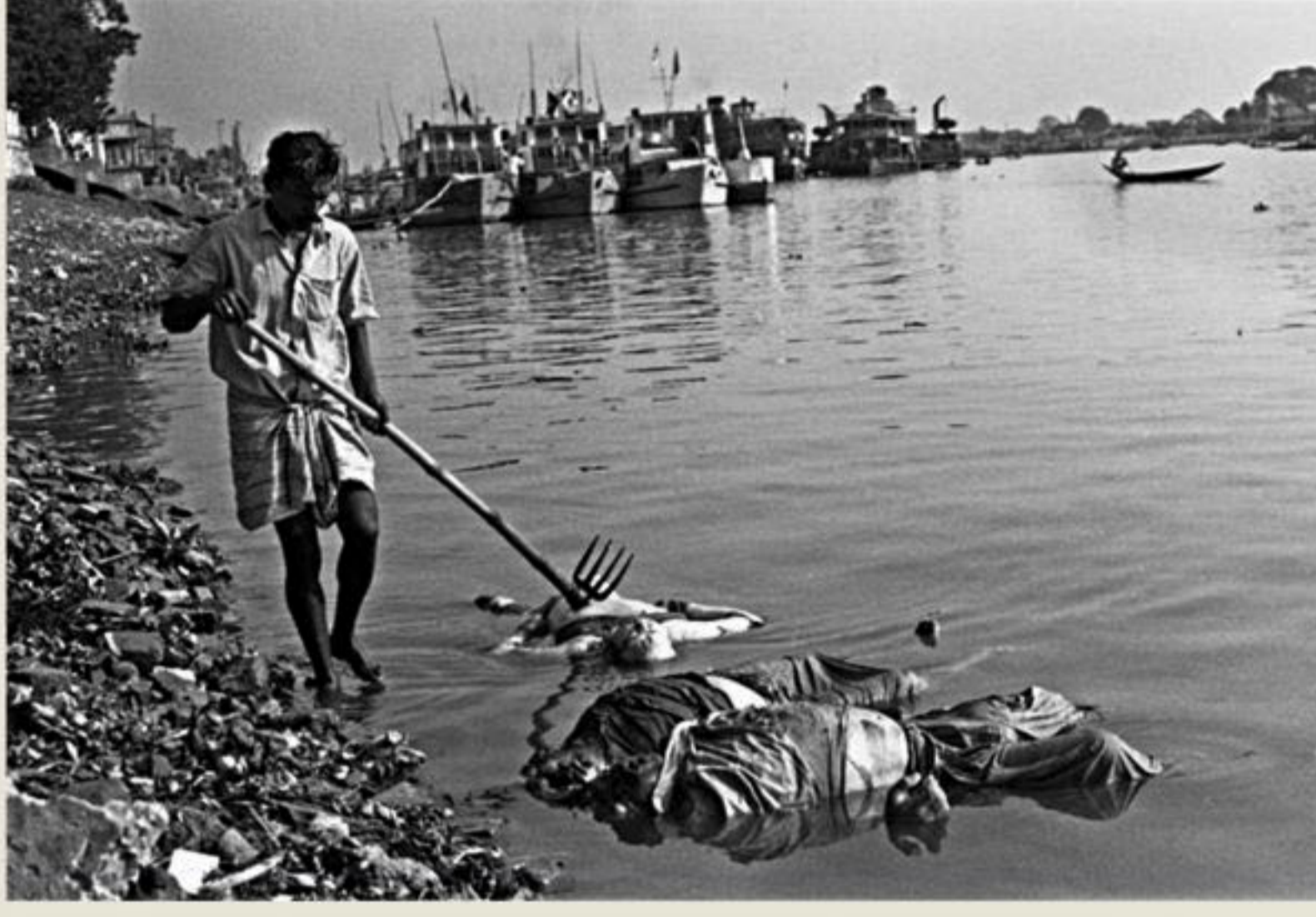
Depicting the brutality of war.

ARTS & ENTERTAINMENT DESK Since starting his career as a photographer in 1967, Anwar Hossain had solidified his legacy as one of Bangladesh's all-time greats in the field with 5 national awards and more than 60 international awards. However, his legacy spans more than tangible awards can portray, having taken some of the most iconic photos of Bangladesh's Liberation War. An equally impressive cinematographer with films like Surja Dighal Bari , Chitra Nodir Pare , Lalsalu and Shyamol Chhaya becoming masterful works under his artistic eye. Today, we mourn the sudden demise of the great man, remembering some of his iconic works.