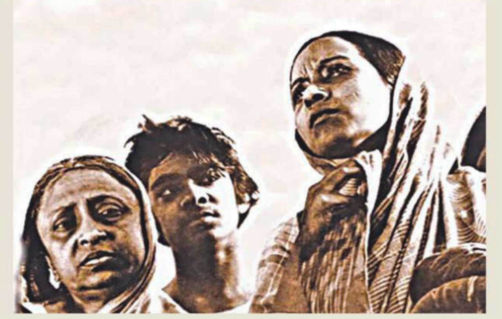
A memorable capture from 'Surja Dighal Bari', cinematography by Anwar Hossain.