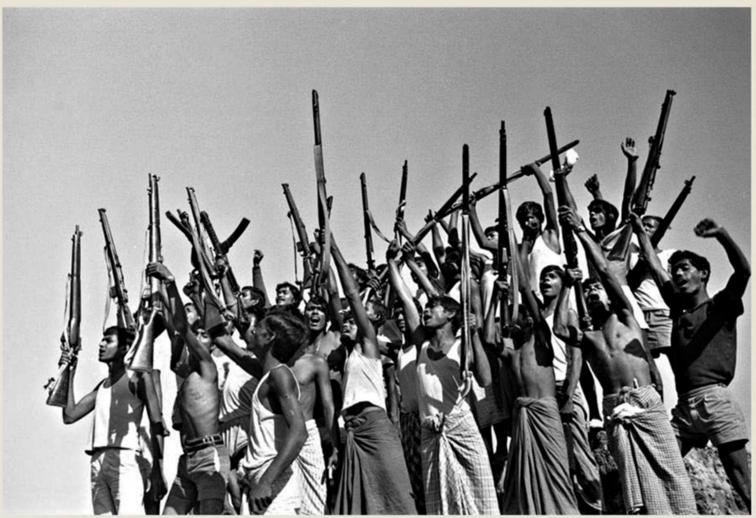
One of the most iconic moments of the Liberation War, a jubilant Mukti Bahini celebrating victory.

Drummers' Union Title: Bangladesh Drum Day Venue: Russian Cultural Center Date: December 7 Time: 3:30 pm - 10:30 pm