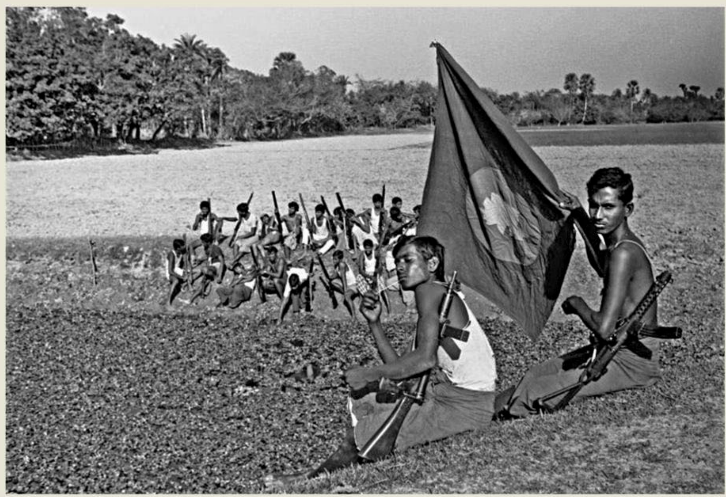
An adamant Mukti Bahini during the war.