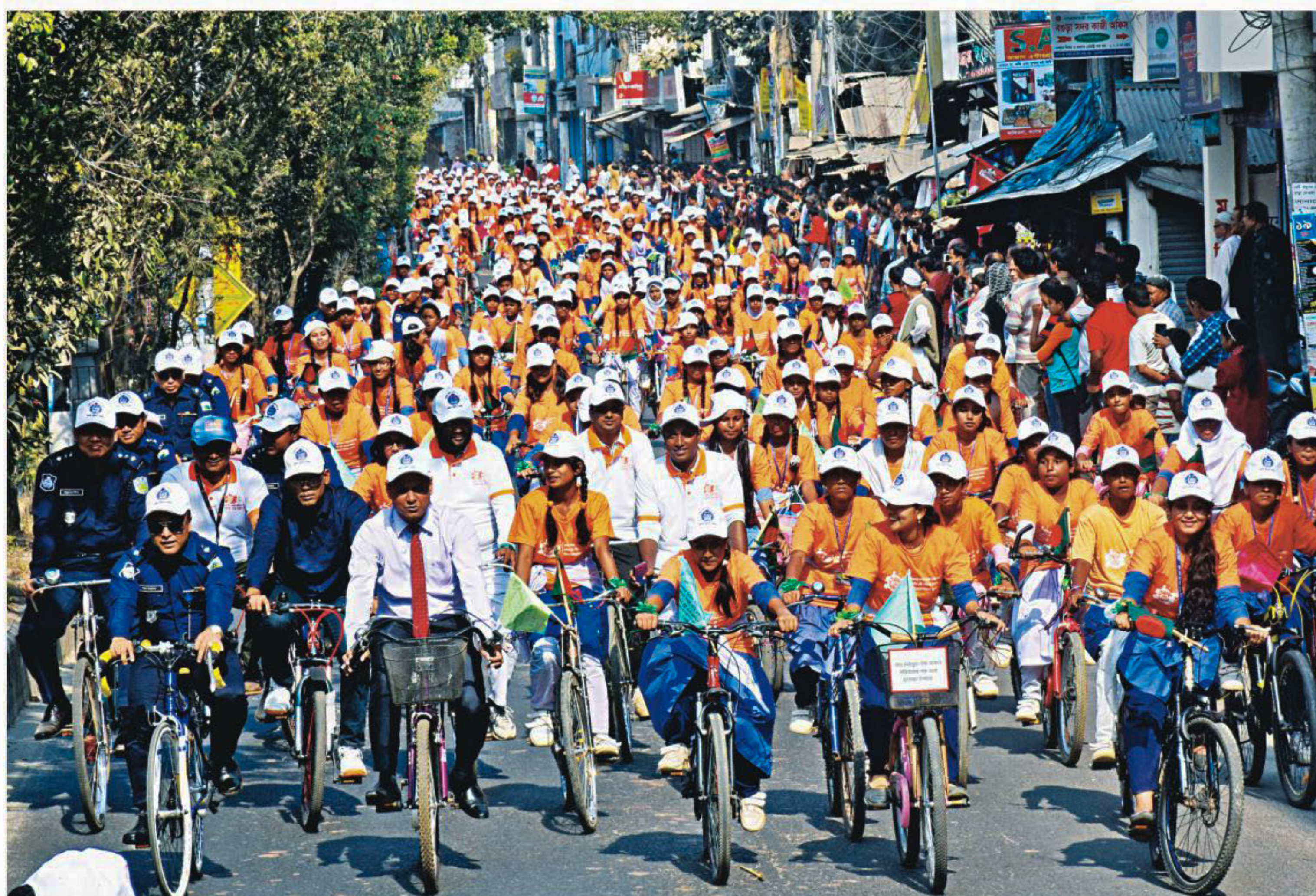
Over 500 girls from 37 schools and colleges join a bicycle procession in Bogura yesterday to protest violence against women. The district police organised the event marking the International Day for the Elimination of Violence against Women, observed globally on November 25.