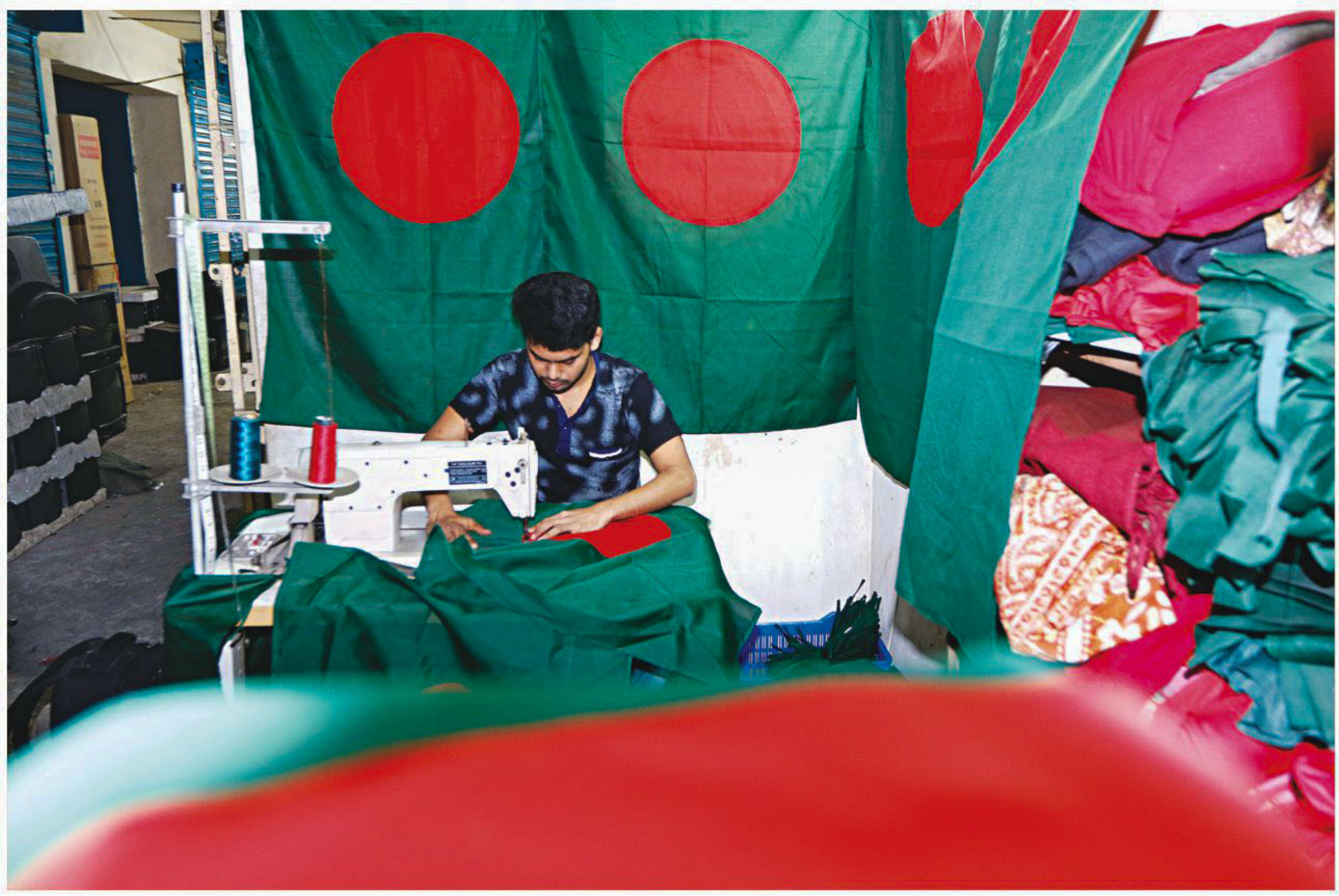
The month of victory begins today. When the nation will observe December 16, the most glorious day in the history of Bangladesh, the red-green national flags will adorn houses and establishments across the country. Tailors are passing busy hours as they have to supply thousands of flags before the celebration. The photo was taken on Bangabandhu Avenue in the capital yesterday.