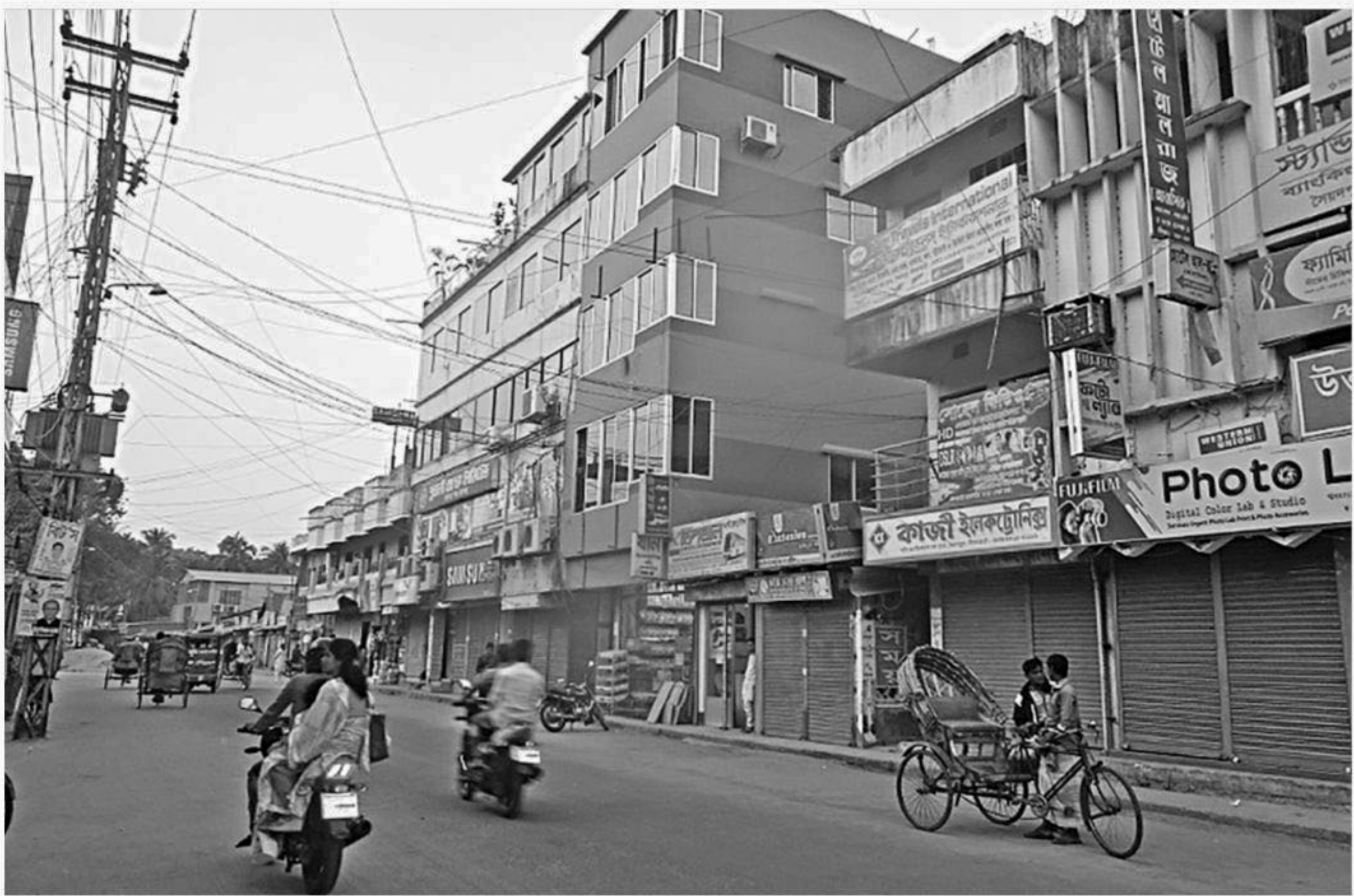
High rise buildings on occupied railway land in Saidpur municipality of Nilphamari.

Works department in Saidpur informed that there are 2488 rail quarters for accommodating officers and workers of country's largest Saidpur rail workshop but 1470 are occupied.