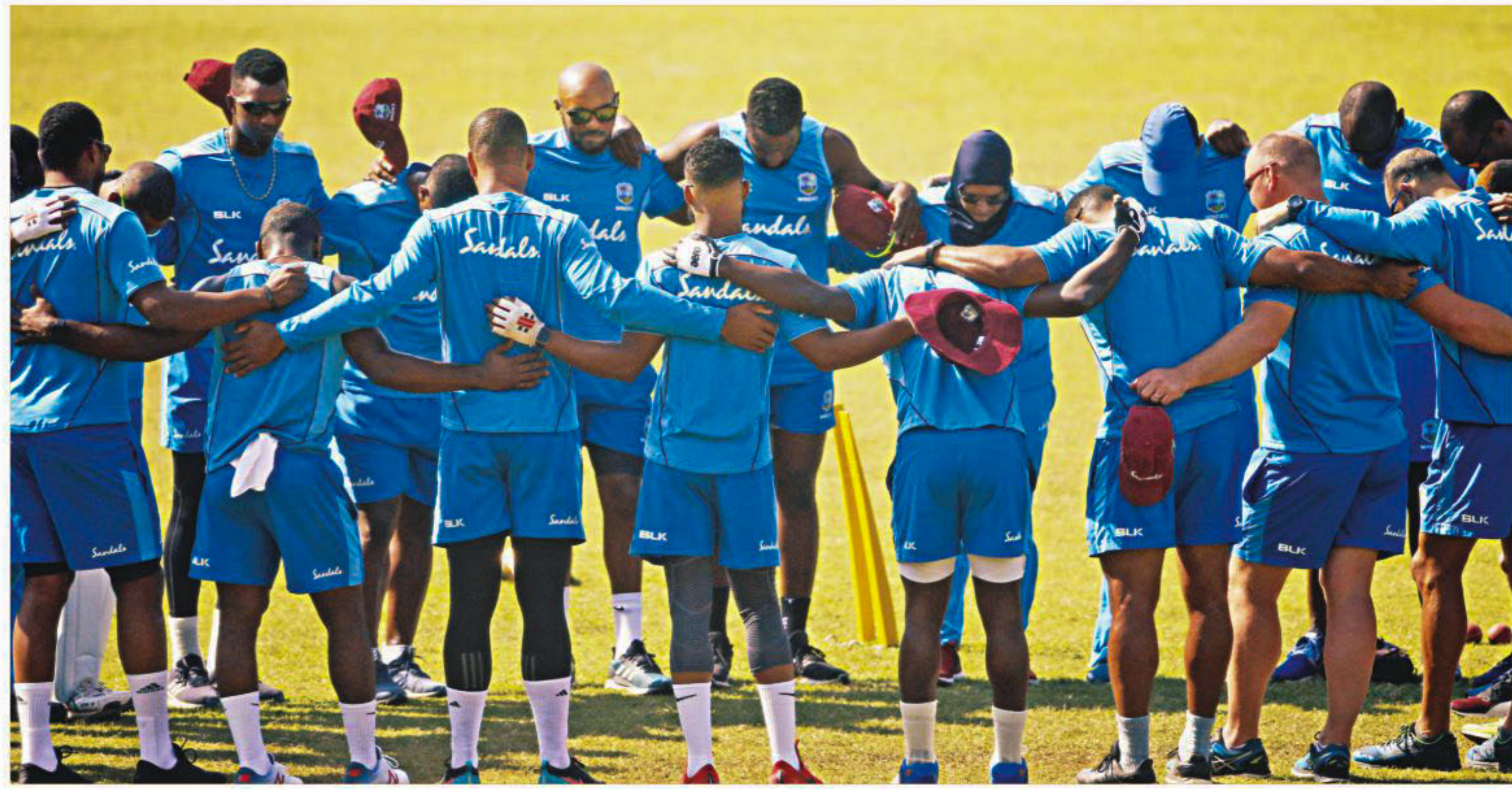
Ahead of the second Test against Bangladesh starting in Mirpur tomorrow, West Indies players were discussing how to bounce back and take a share of the two-Test series during training yesterday.