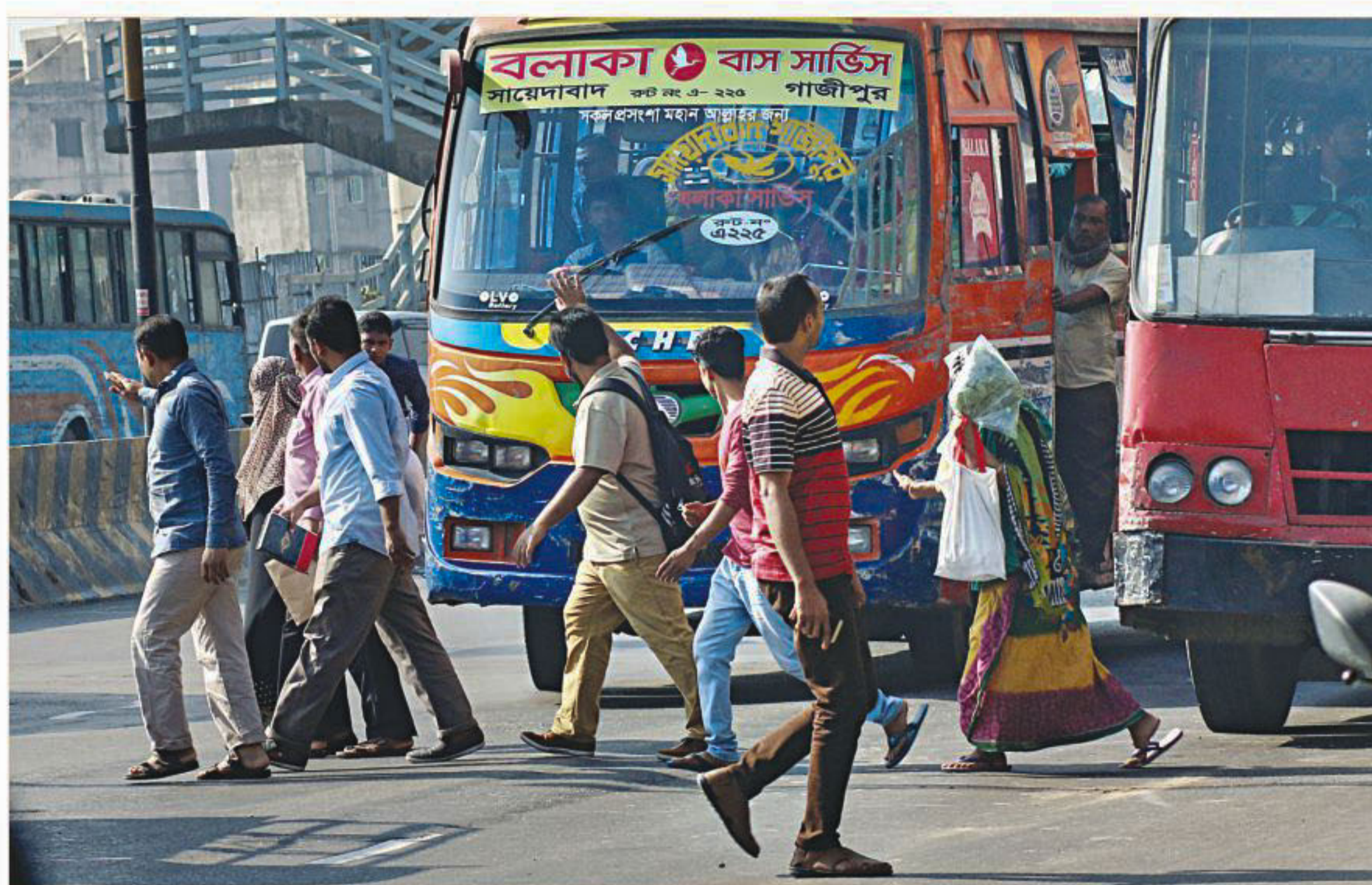
Although a footbridge is only a few metres away, people jaywalk on Airport Road near the city's Kuril Bishwa Road bus stop. Such jaywalking often leads to accidents and disrupts the flow of traffic. The photo was taken on Monday.