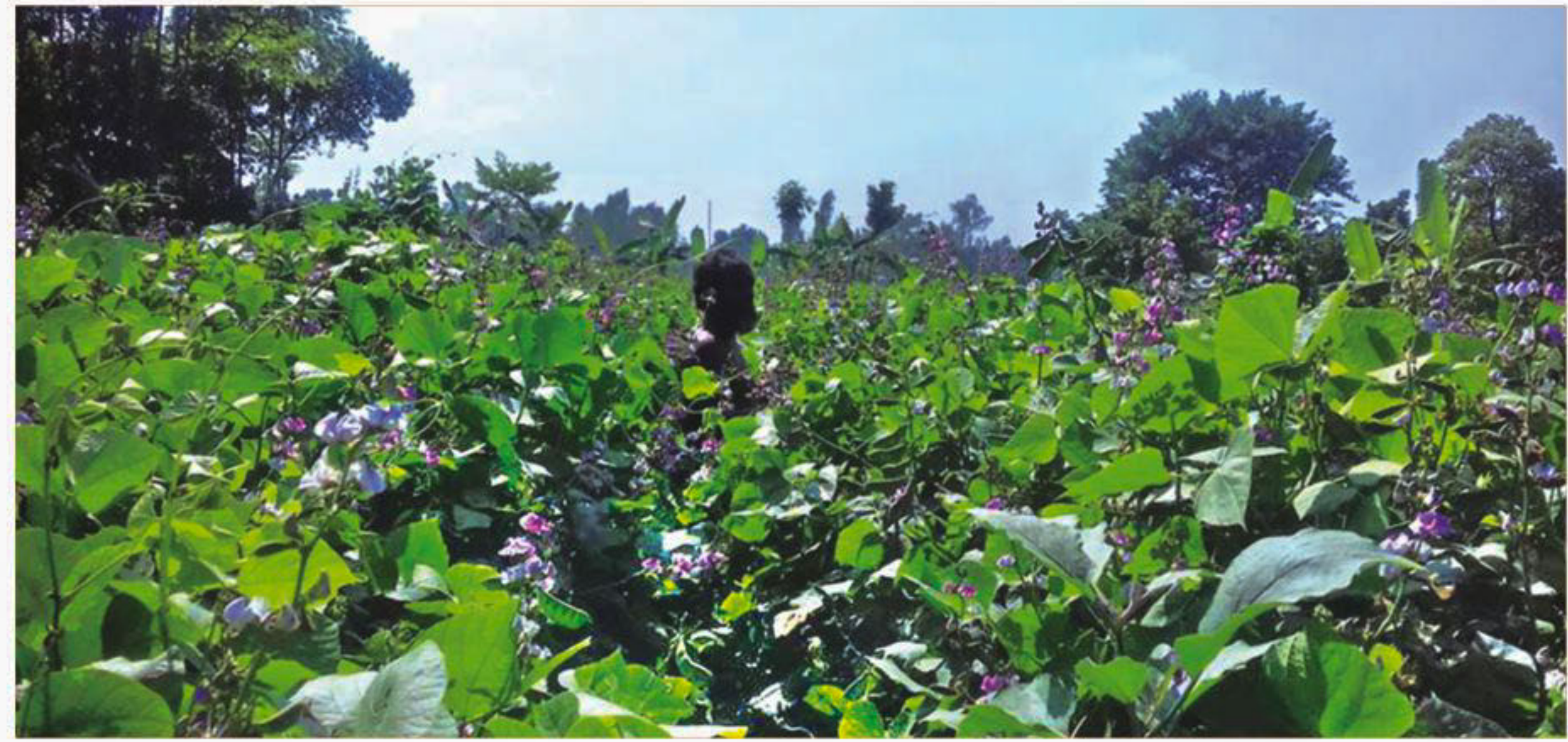
A grower plucks bean from his field at Dhumaitari village in Gaibandha's Sundarganj upazila.