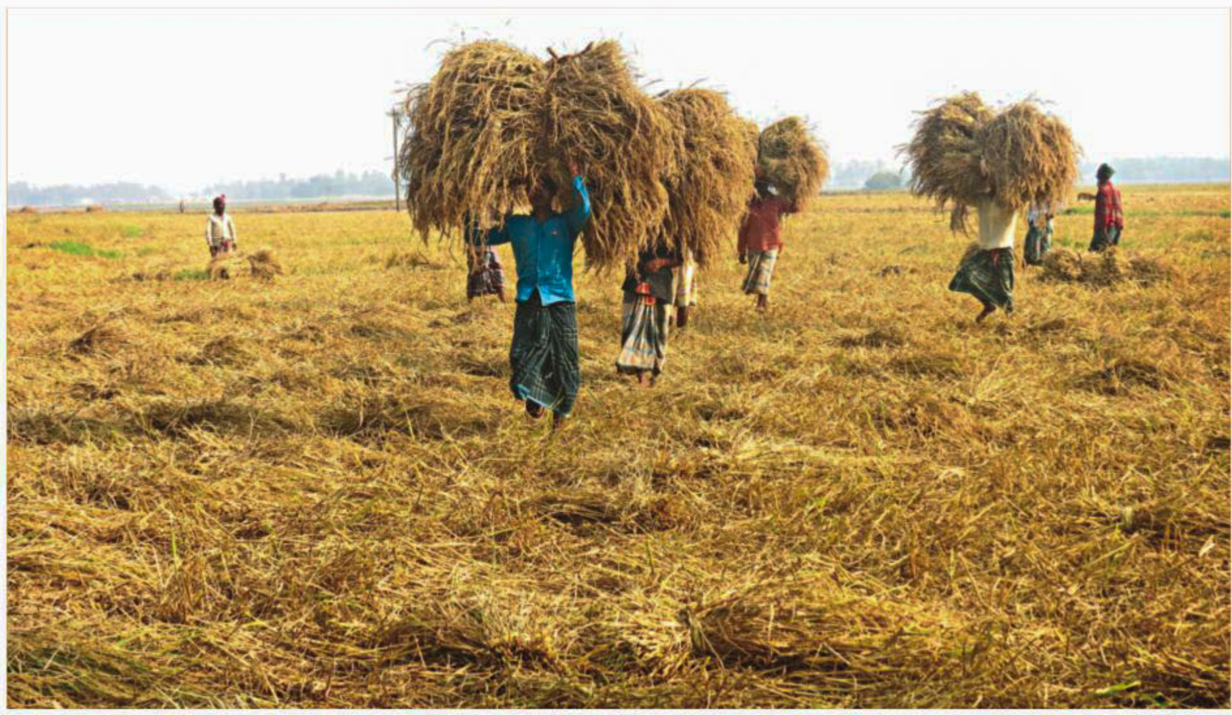
Farmers in Boldhi area under Kalihati upazila of Tangail take home harvested paddy.