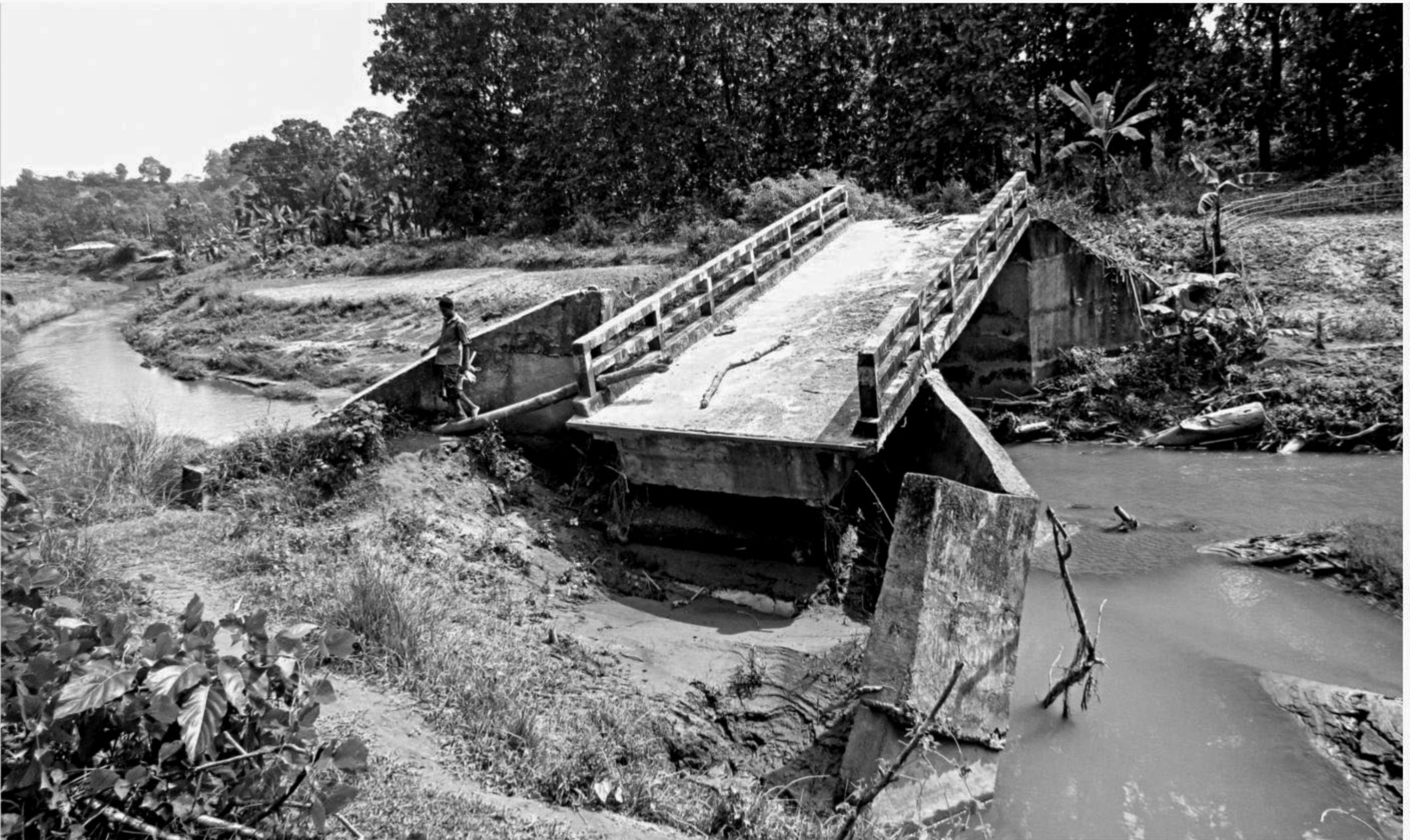
This bridge over Suridas Para canal in Naniarchar upazila of Rangamati is yet to be repaired since it collapsed two years ago.