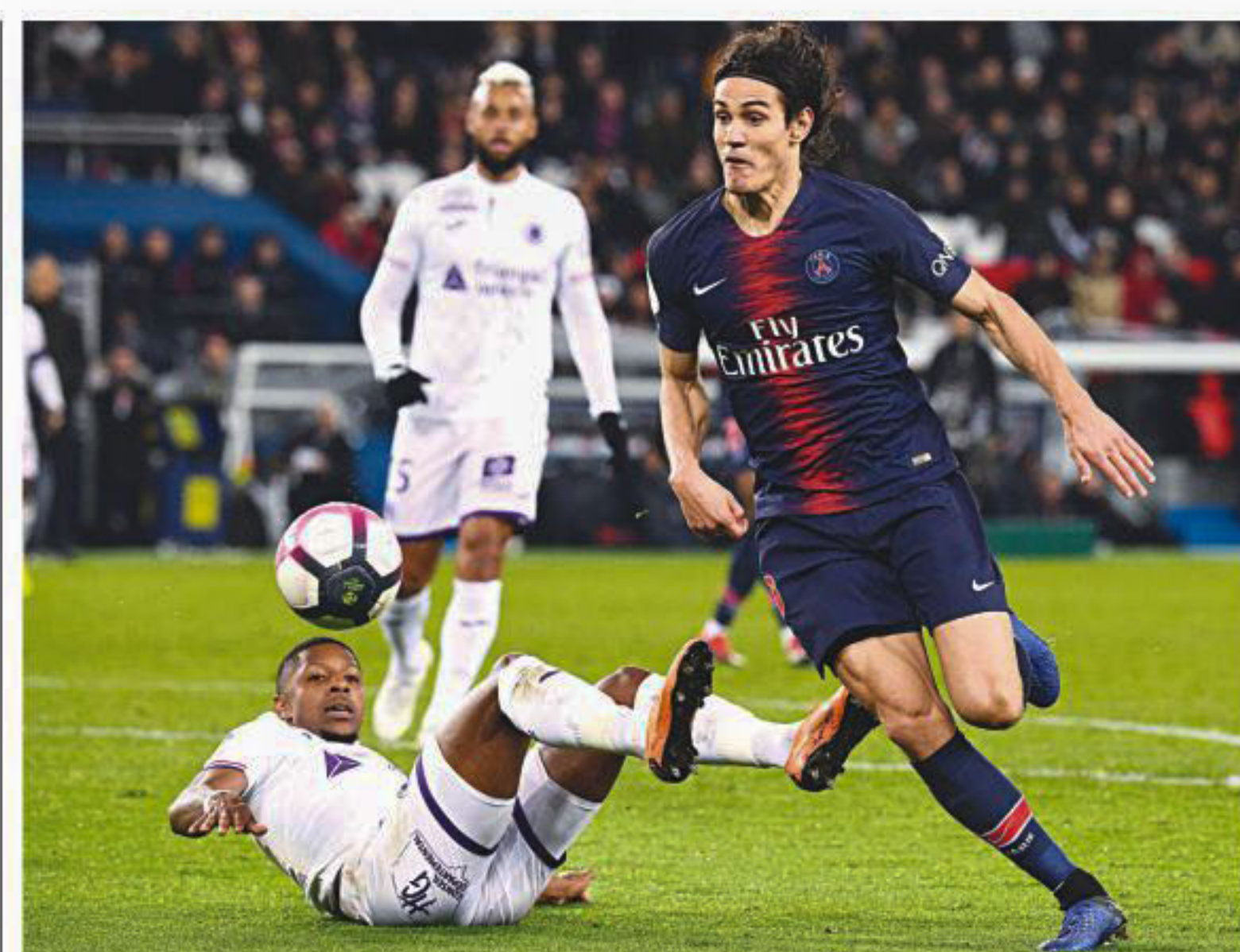
Paris Saint-Germain's Uruguayan forward Edinson Cavani (R) scored the all-important goal against Toulouse during their French Ligue 1 match at the Parc des Princes Stadium in Paris yesterday.