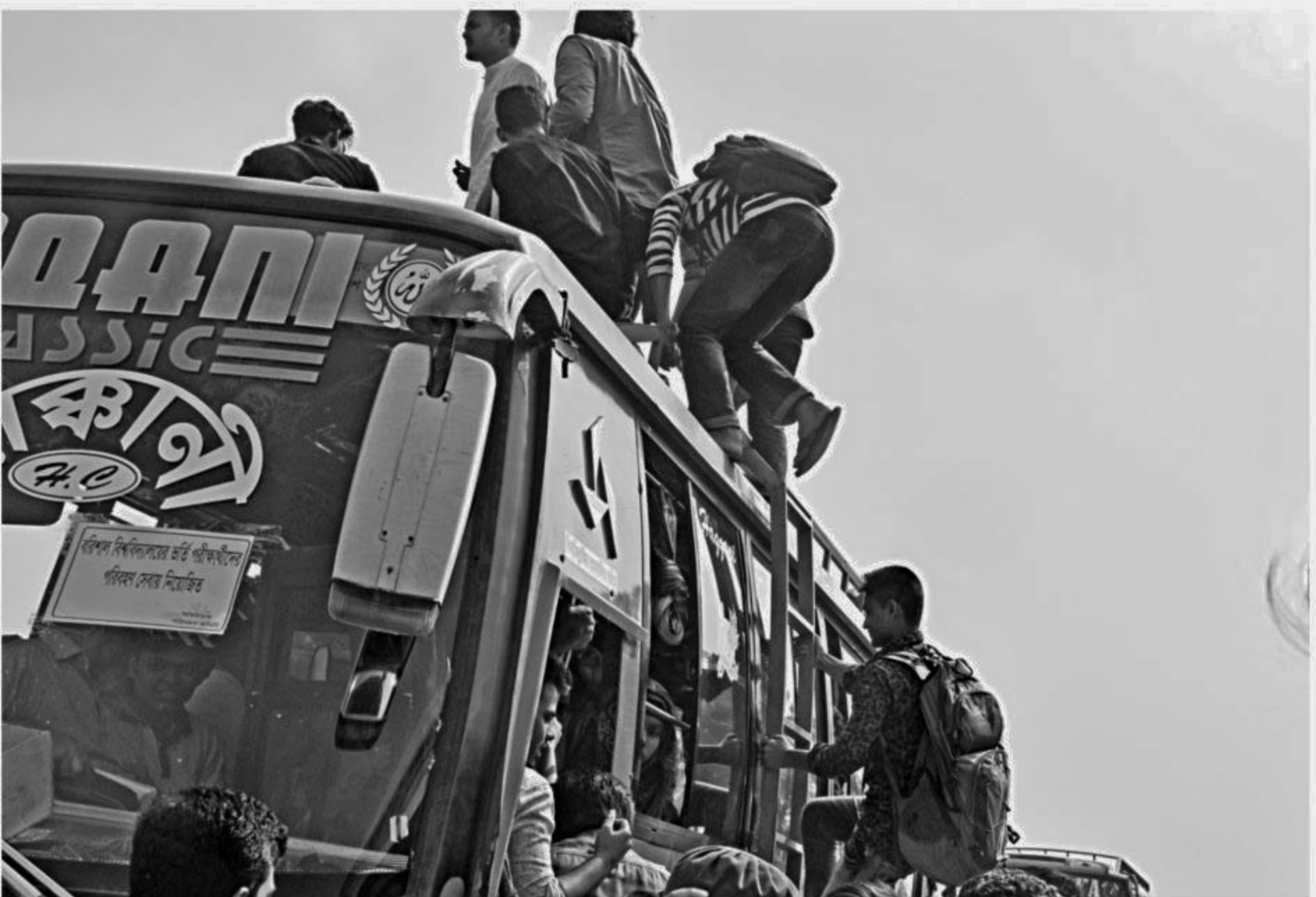
Defying risks, admission seekers of Barisal University get on the roof of an overcrowded bus to go back home after the admission test yesterday. This was one of the buses rented by Barishal City Corporation to provide free rides to aspirants coming from different parts of the division. The photo was taken on Barishal-Kuakata highway near the university.

People irrespective of different professions are reaping the benefits from agriculture, fisheries, livestock, savings, credit distribution, dairy and cottage industries, garments, housing, banks, insurances, commodity marketing, and under projects like Asrayan and Ekti Bari Ekti Khamar under the cooperatives society, the prime minister added.