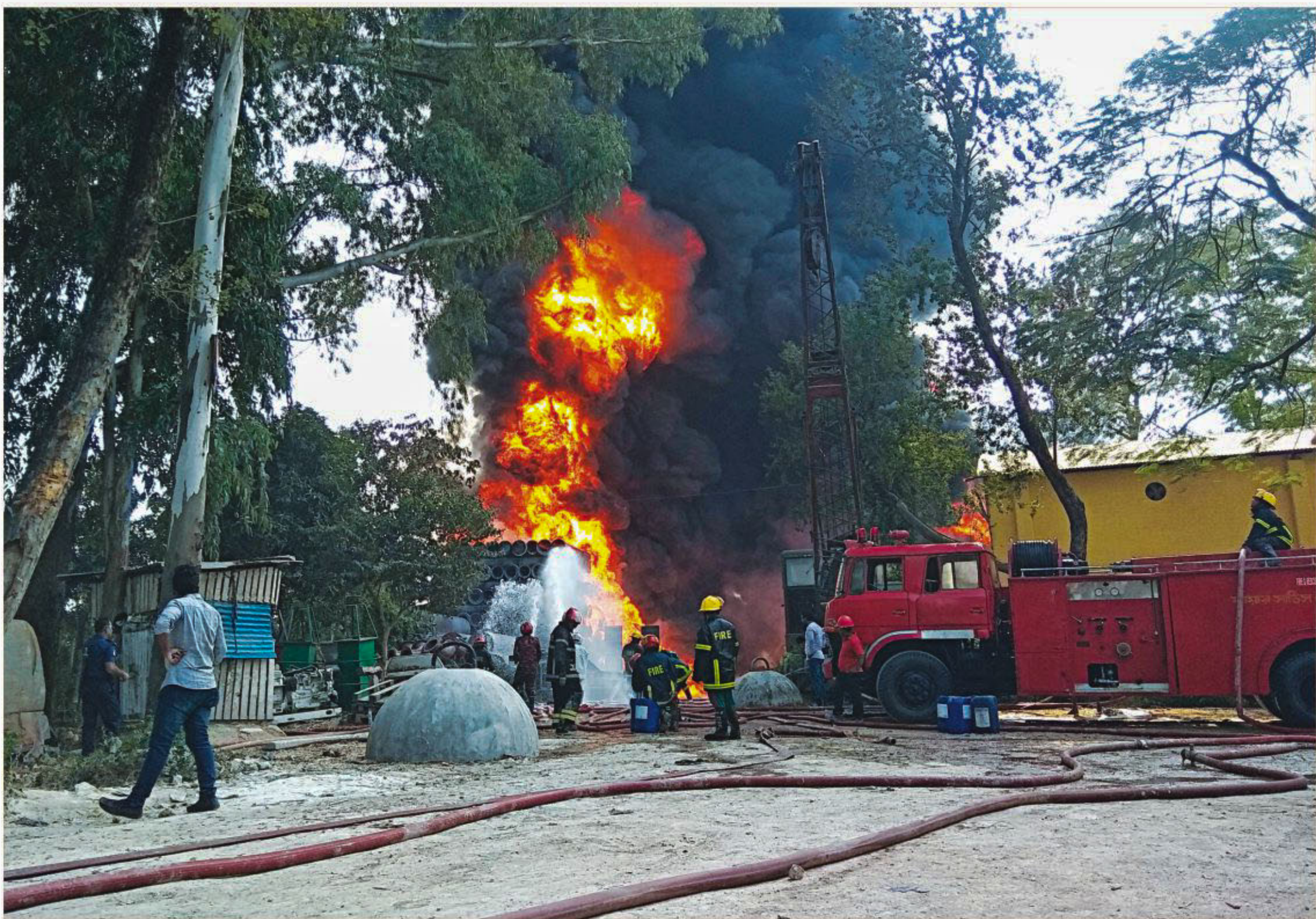
Firefighters trying to douse the fire that broke out at a warehouse of Bangladesh Inland Water Transport Authority (BIWTA) in Narayanganj yesterday noon. The blaze came under control in the evening.

PRAYER TIMING NOVEMBER 24 Fazr Zohr Asr Maghrib Esha AZAN 5-05 12-45 3-45 5-21 7-00 JAMAAT 5-40 1-15 4-00 5-24 7-30 SOURCE: ISLAMIC FOUNDATION