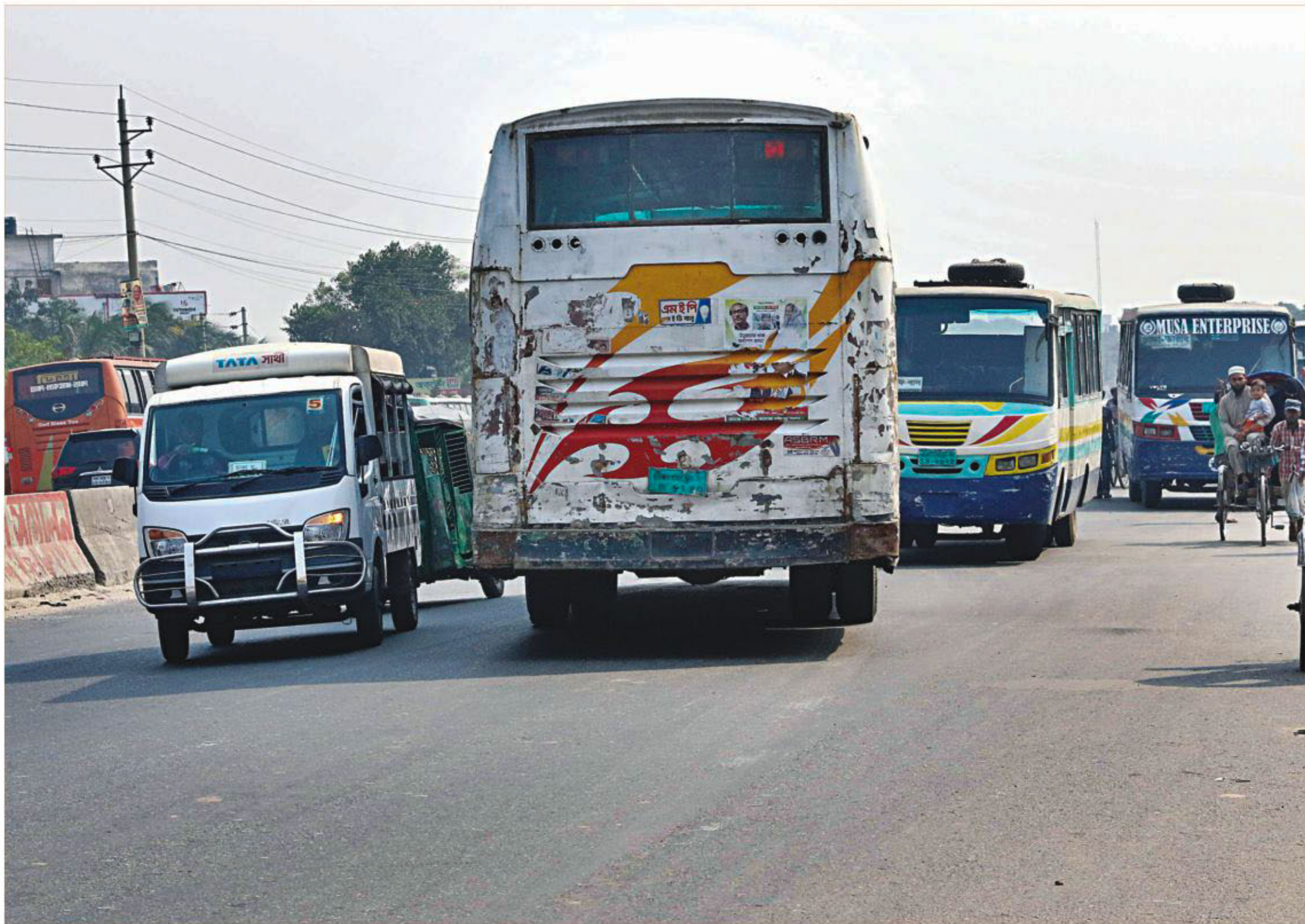
A bus drives against traffic on Dhaka-Chattogram highway in the capital's Shanir Akhra area yesterday. Despite several traffic awareness campaigns in the last couple of years, there has hardly been any changes in the city's traffic situation.