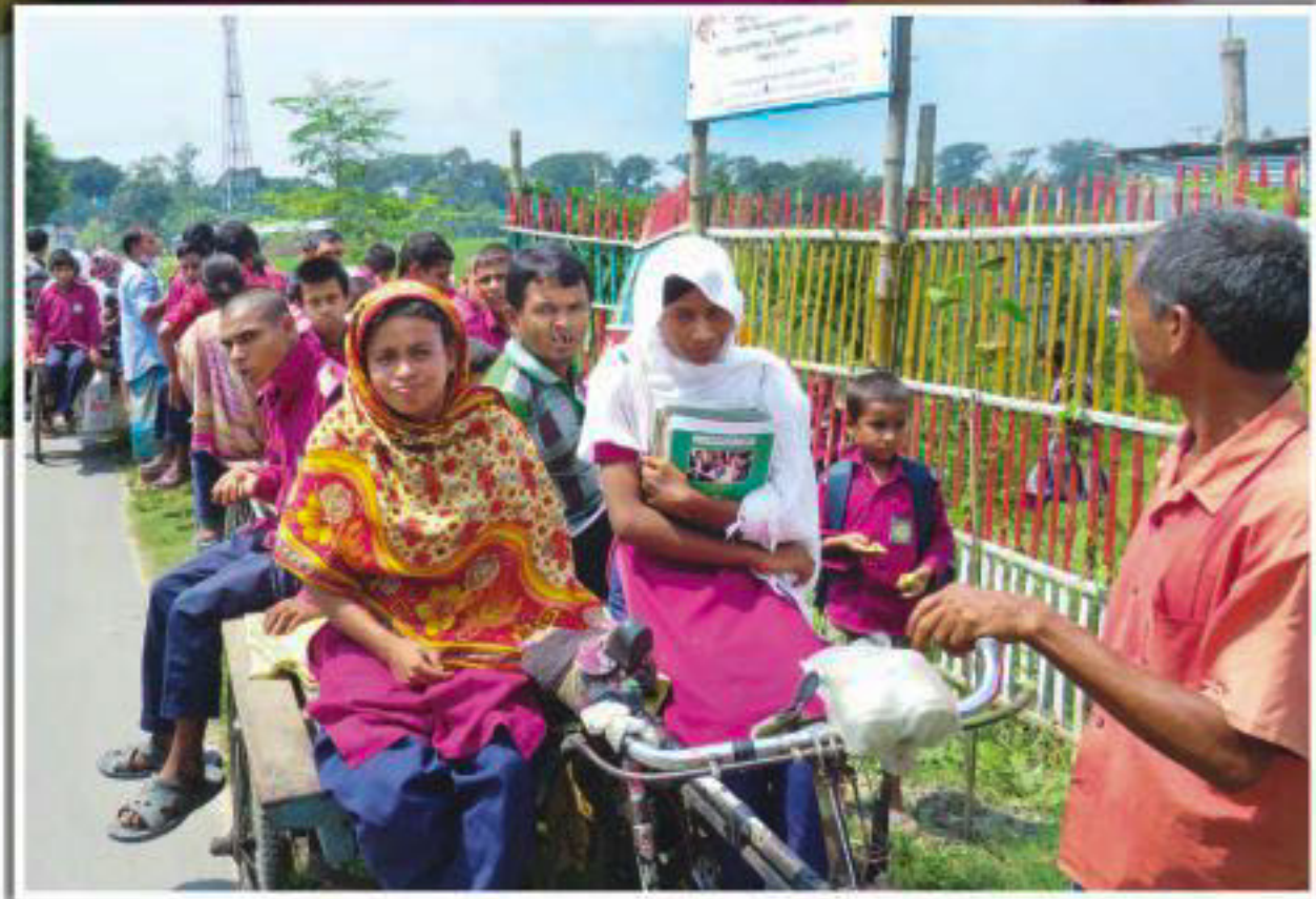
Children with special needs studying inside a classroom of Rasulpur Protibondhi O Autistic Punarbasan Bidyalaya in Dinajpur's Chirirbandar upazila recently. Inset, some other students being taken to the school in rickshaw vans hired by the school authorities. The school, established in 2016, provides free education to 220 students with special needs in the upazila.