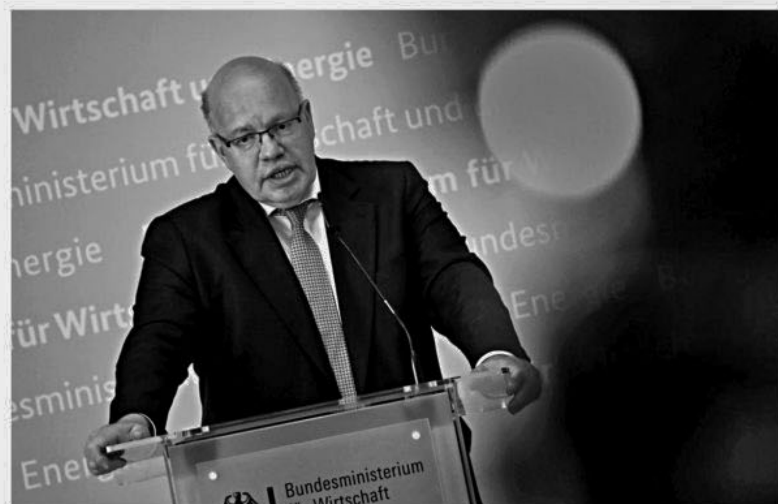
German Economy Minister Peter Altmaier

Germany needs a package of tax cuts and other measures to shore up economic growth in the long term, Economy Minister Peter Altmaier said in an interview published on Sunday, days after the country posted its first economic contraction since 2015.