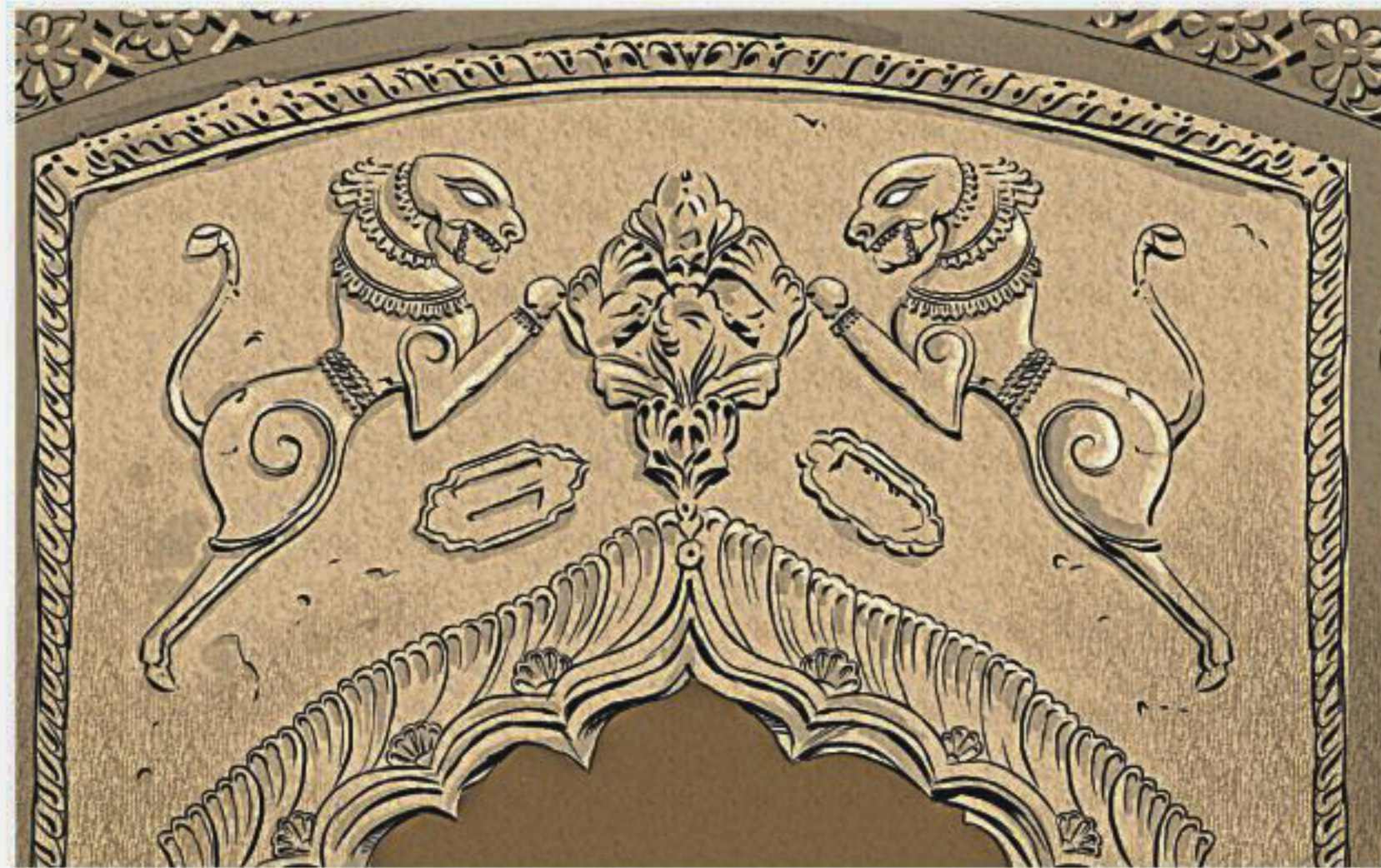
Two lions jumping towards a fruit tree always seem to accompany the Makara, especially in Shiv Temples.