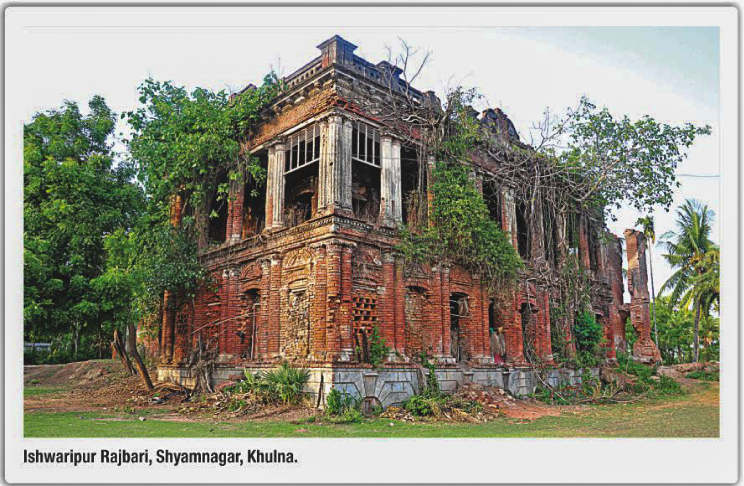
Ishwaripur Rajbari, Shyamnagar, Khulna.