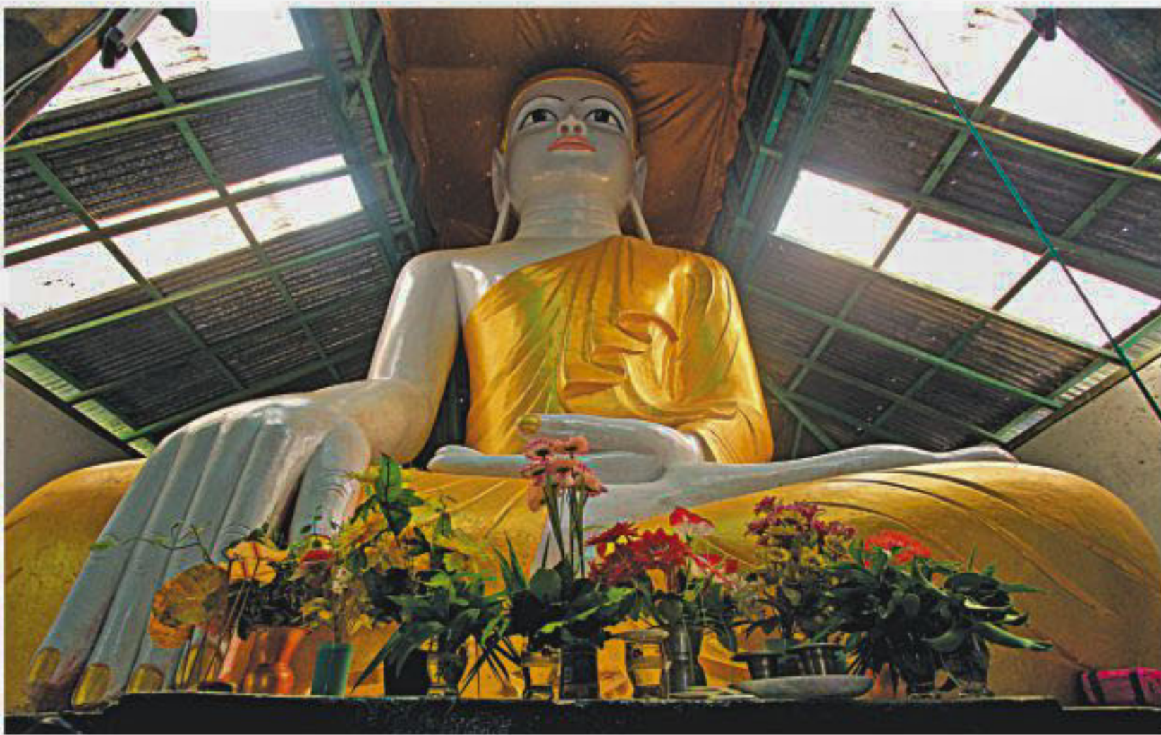
27-foot Buddha statue, Buddha Vihara, Misri Para, Kuakata, Chattogram.