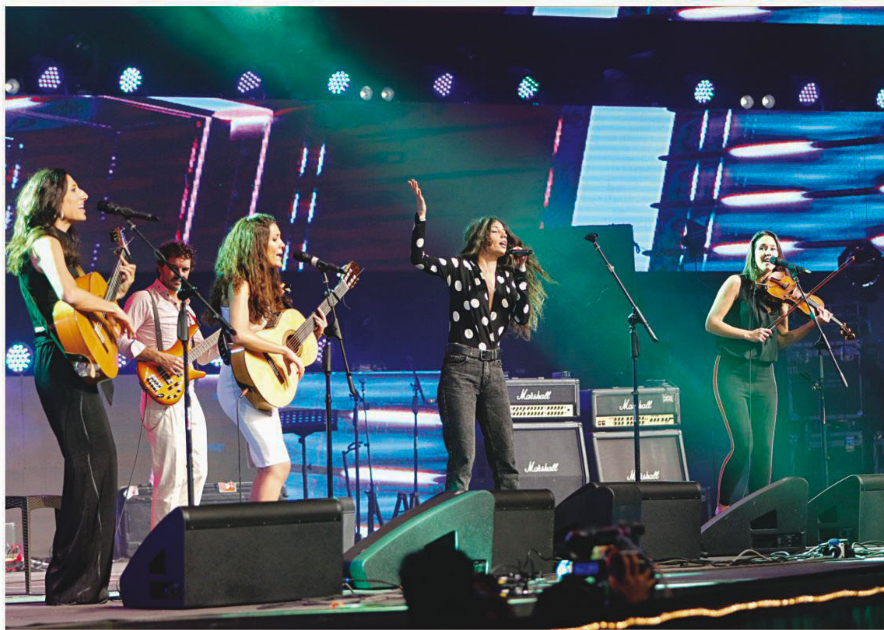
A Spanish all-female musical ensemble, Las Migas performs on the concluding night of the DIFF-2018 at the army stadium.