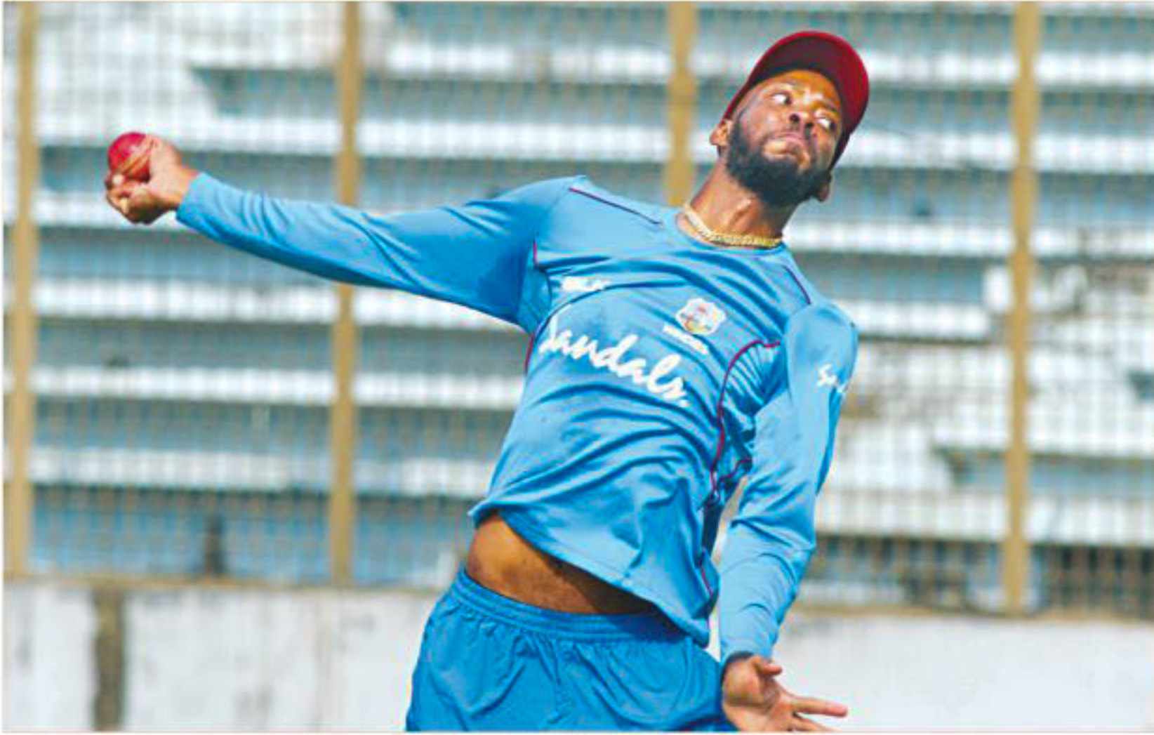
West Indies all-rounder Roston Chase will be expected to do a lot of bowling during the Tests against Bangladesh starting on November 22.

The West Indies squad came separately, with the first wave of players reaching Dhaka on Wednesday and the rest arriving on Thursday. As they were resting it was not a full squad practis-