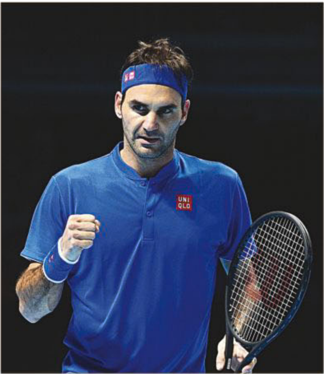
Roger Federer advanced to the semifinals of the ATP World Tour Finals with a simple 6-4, 6-3 win against Kevin Anderson yesterday.

Now playing with freedom, the 37-year-old broke again to seal the victory and guarantee that he tops the group.