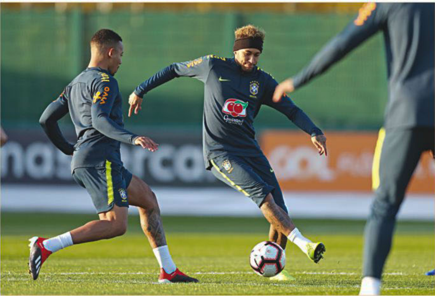
Brazil talisman Neymar got into his mojo and broke out the moves in training on the eve of tonight's international friendly against Uruguay in London.