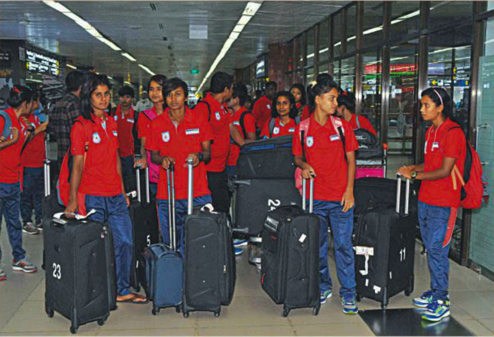
The Bangladesh women's football team had a quiet return on Wednesday from Myanmar, where they endured a horrid campaign in the 2020 Olympic Qualifiers.

This is happening due to the fact that the focus was firmly on the under-16 team while the players above that age group had largely remained out of international matches even though they were training with the rest of the players.