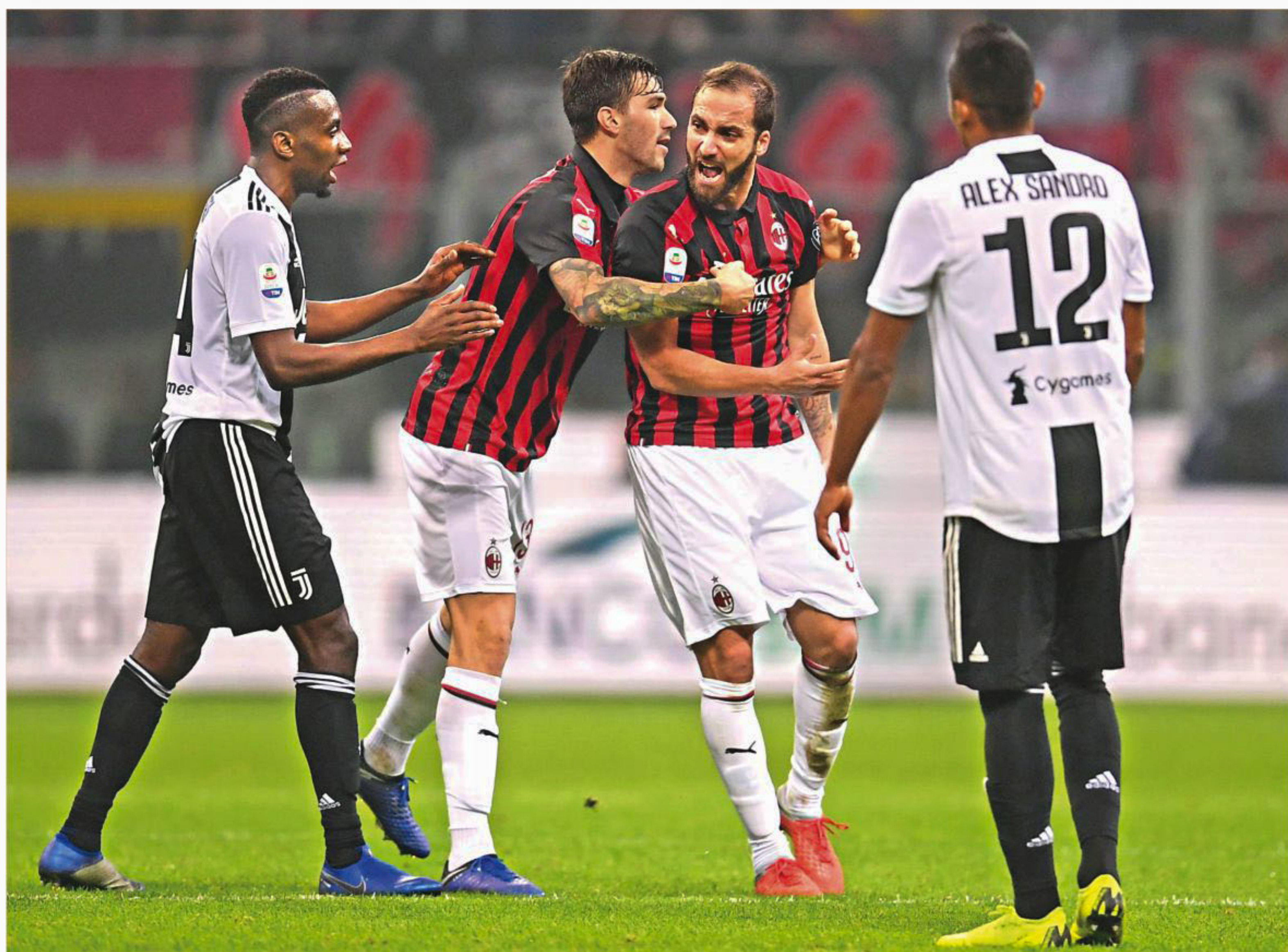
AC Milan striker Gonzalo Higuain (2nd from R) is restrained by his teammate as he reacts angrily to a red card during their Serie A clash against Juventus at the San Siro on Sunday.

AC Milan's third loss this season saw them drop out of the Champions League places into fifth behind Lazio who moved back into fourth despite a 1-1 draw at Sassuolo.