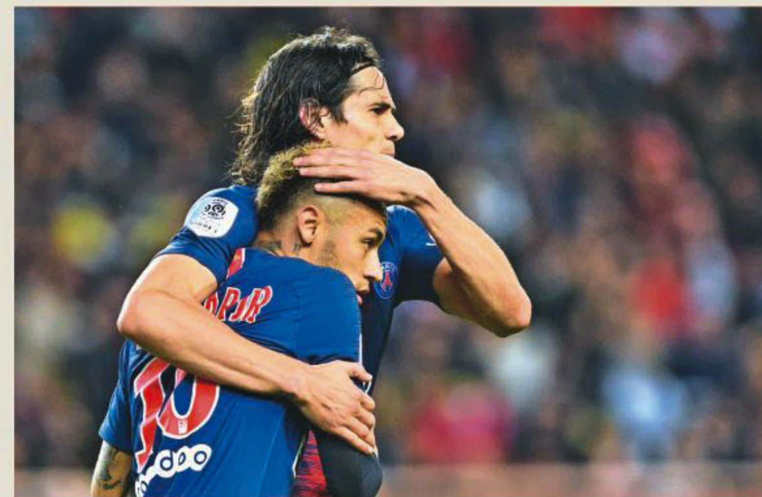
Paris Saint-Germain striker Edinson Cavani (L) celebrates his hatrick against Monaco with teammate Neymar on Sunday.