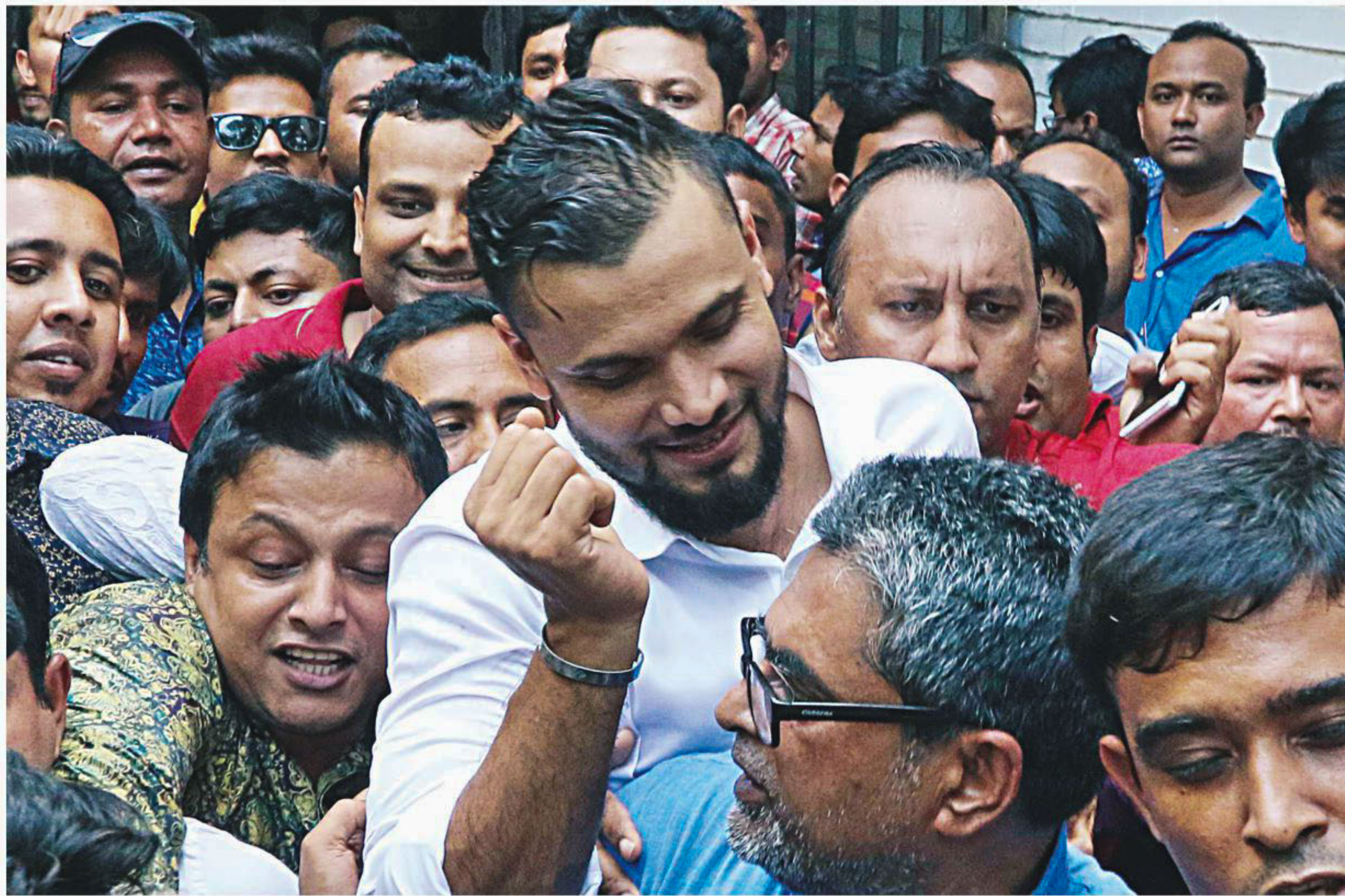
Bangladesh's most successful ODI captain Mashrafe Bin Mortaza collects a nomination form for the 11th general election from the Awami League president's Dhanmondi office.