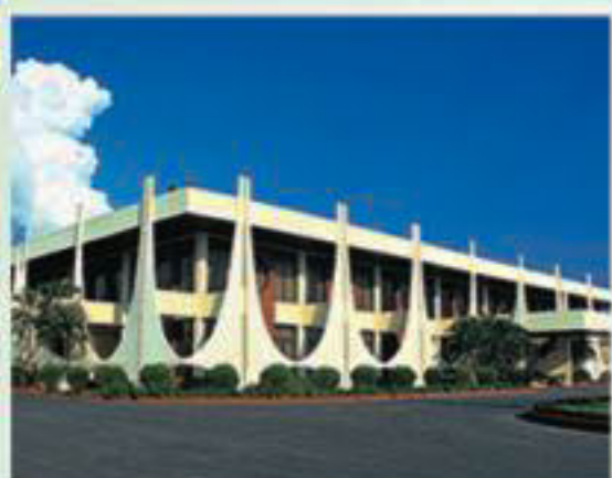
VVIP Terminal at Hazrat Shahjalal International Airport