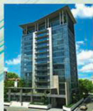
Concord Baksh Tower