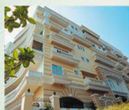
Lake Front Concord