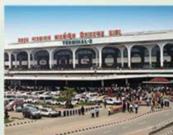
Passenger Terminal Building at Hazrat Shahjalal International Airport