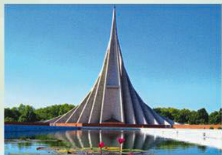
National Monument (Completed by Concord in only 89 days)