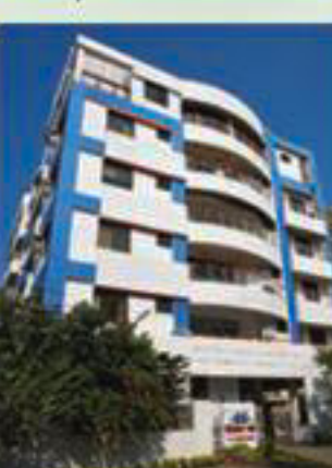
President Park Concord