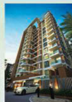
Mozammel Villa Concord