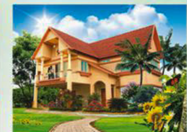
The Resorts by Concord

CONCORD GROUP OF COMPANIES Concord Centre, 43 North Commercial Area, Gulshan-2, Dhaka-1212 Telephone: 58814030, 58814028, 9896482, 9844724 Website: www.concordgroup.net