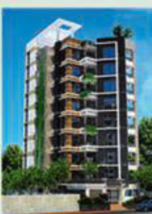
Concord Kamal Court