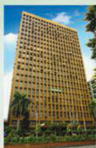
Bangladesh Shilpa Bank