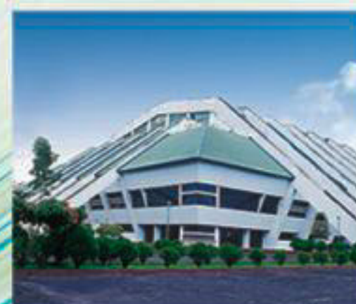
National Indoor Stadium