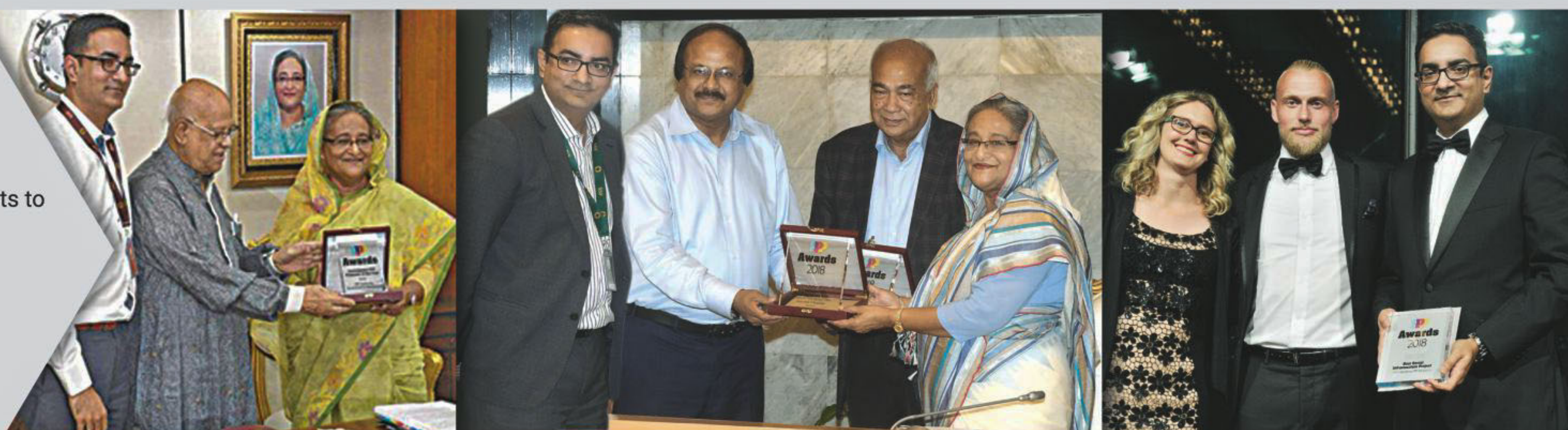
Award Judges, PPP Bulletin

"Considering the authority's achievements to be "astounding" given its limited time in operation, the judges felt that this organization was worthy of recognition for its strong progress over recent years. They also highlighted the authority as a model for replication by other developing countries in the region".