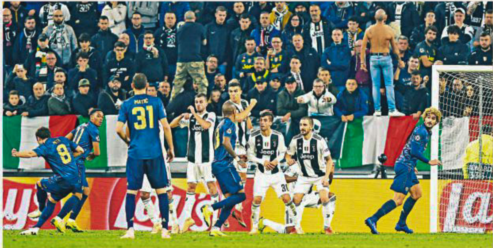
Juan Mata (L) curls in the sublime free-kick that started Manchester United's comeback against Juventus in Turin on Wednesday.

"You can't even talk about luck, because you have to find your own luck and in this case we just gifted it to them. Now we've got to lift our heads, as we played really well and are still top of the group."