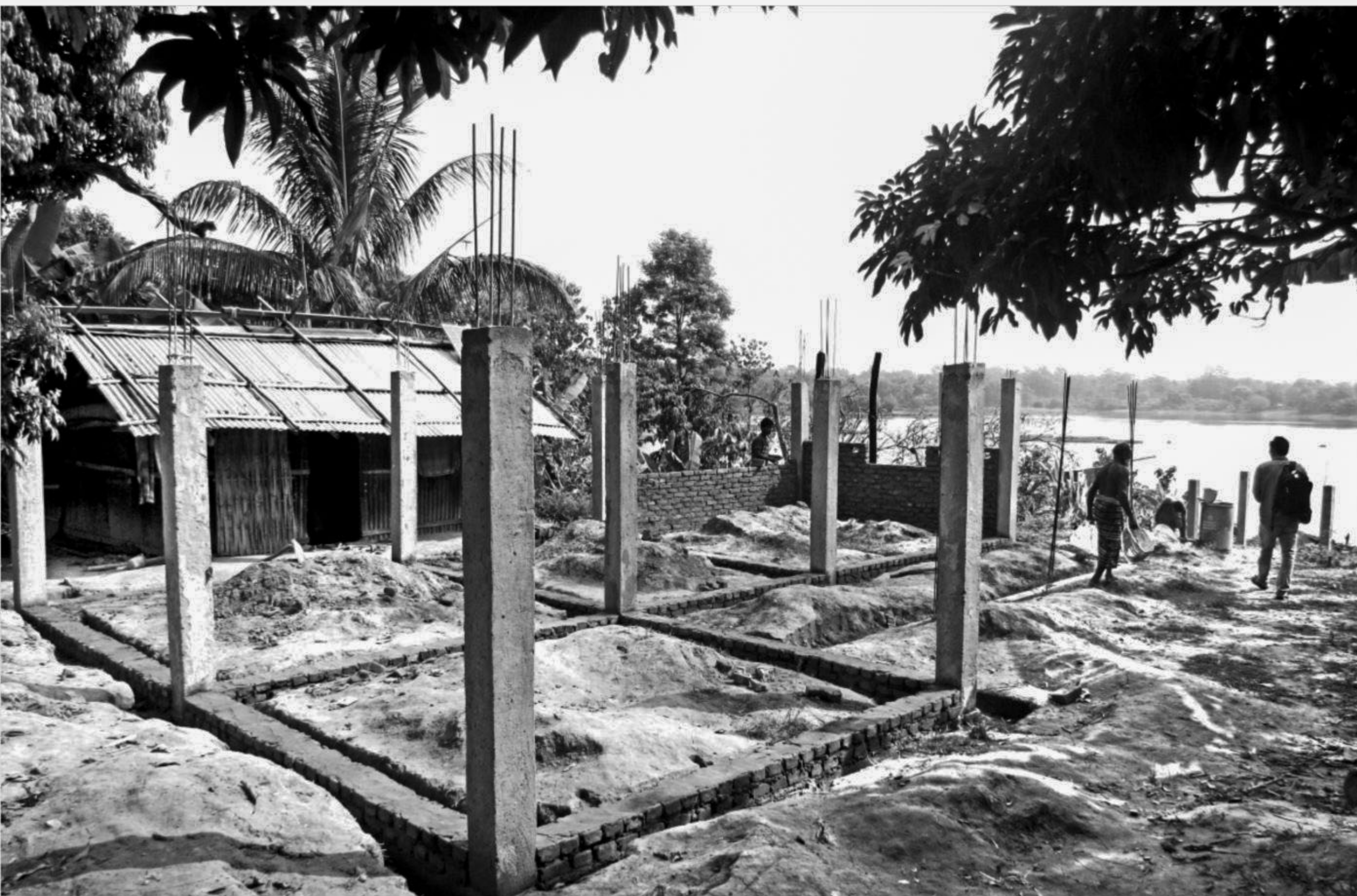
An under-construction house at Manikjowr Chhara village in Rangamati's Longadu upazila.