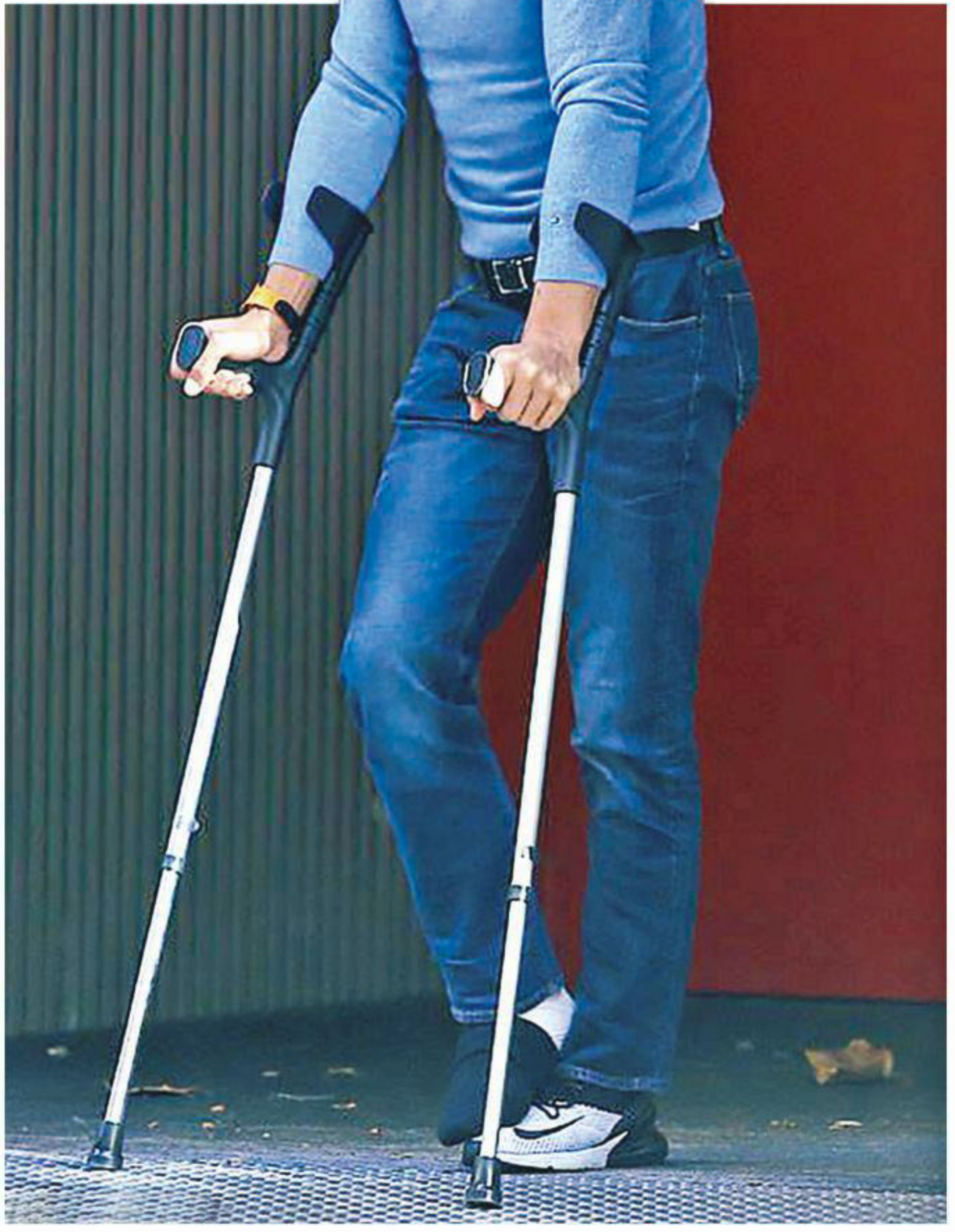
A despondent Rafael Nadal was pictured with his right foot heavily bandaged as he left a hospital in Barcelona on Wednesday, having undergone an ankle surgery that has ruled him out of the season ending ATP World Tour Finals.