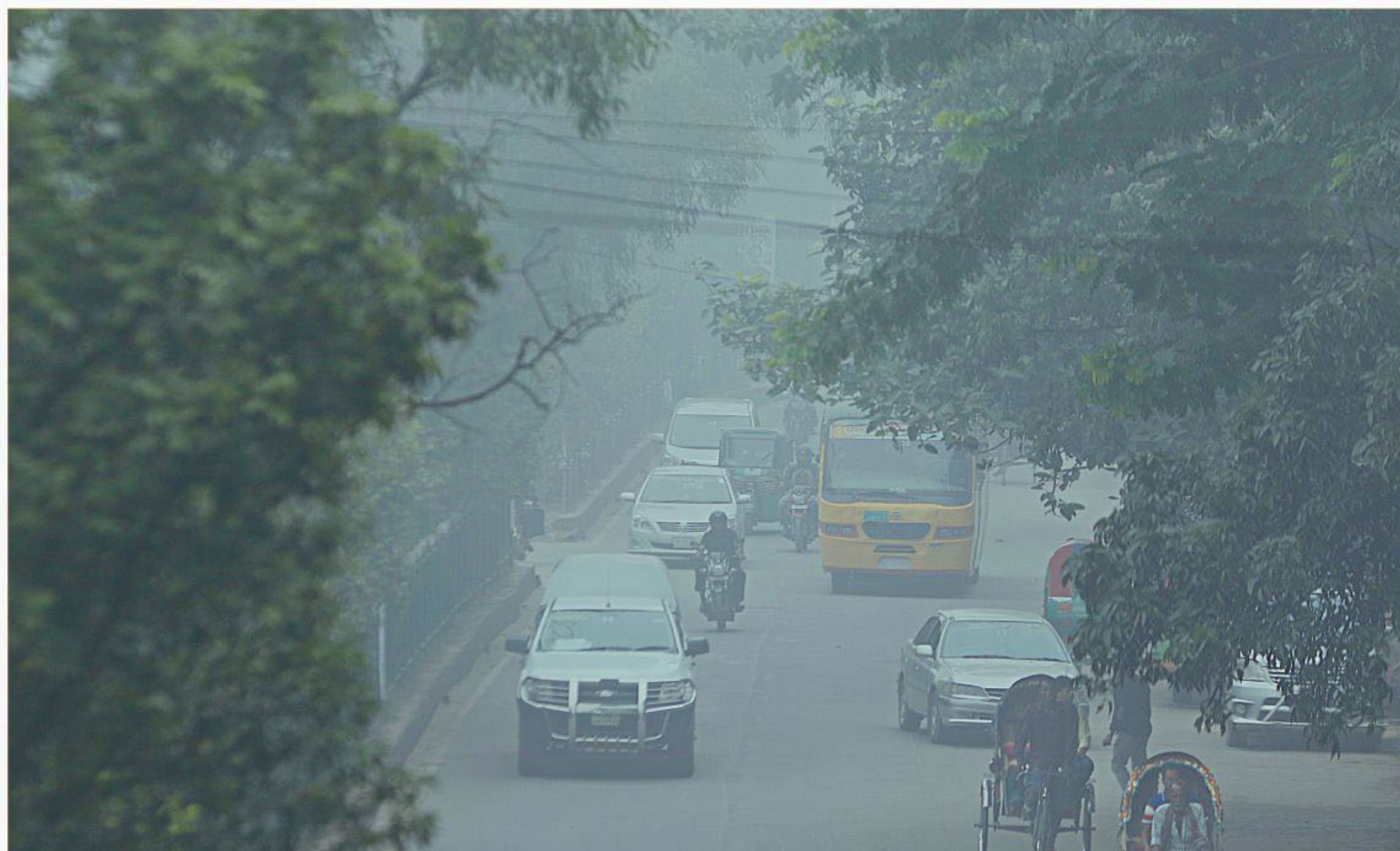
Vehicles plying a road amid fog in the capital. Dhaka residents woke up to a misty morning accompanied by slight chill in the air yesterday. The photo was taken around 9:00am from Mirpur 10.

The trains will depart Kamalapur railway station at 5:20pm and reach Bangabandhu Setu (east) railway station at 8:30pm; return trains will depart Bangabandhu Setu station at 6:00am and reach Kamalapur railway station at 8:50am, the release added.