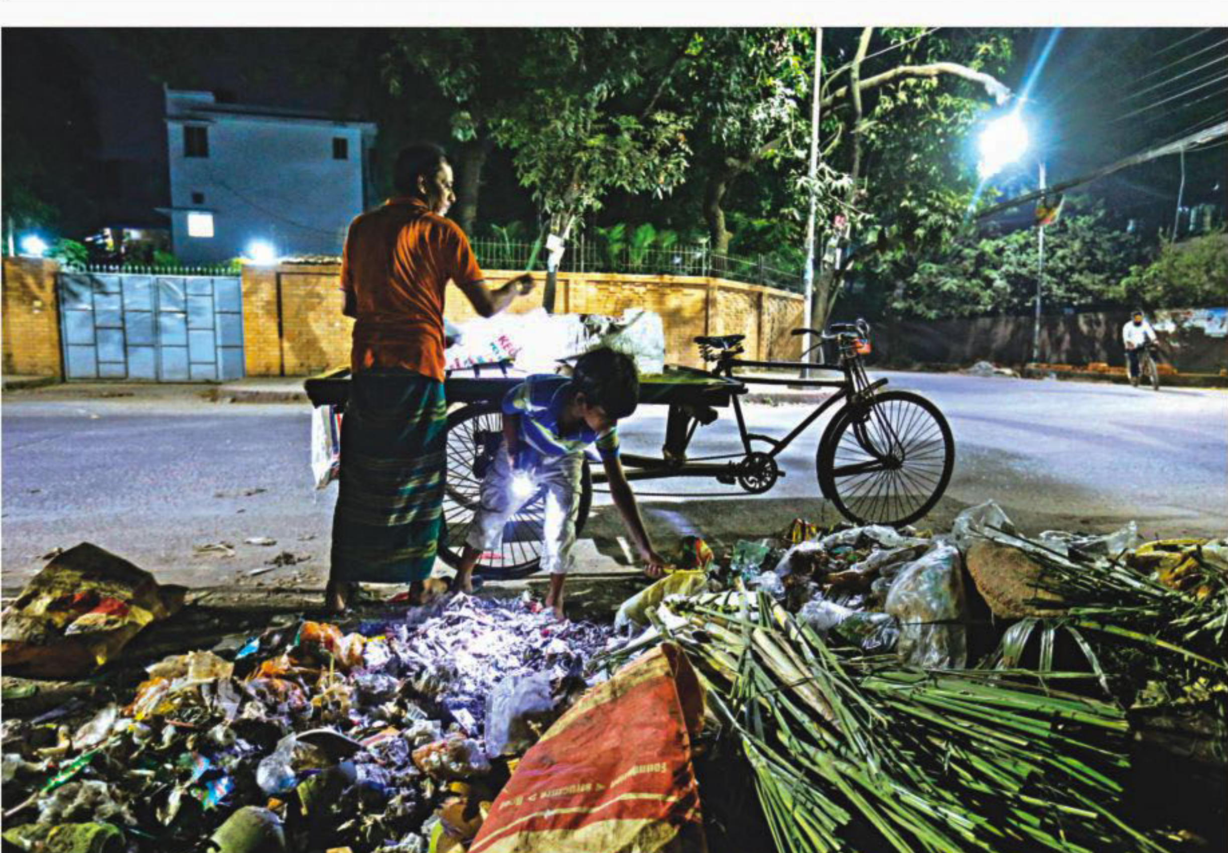
The father and son duo at work around 2:00am at Purba Razabazar in Dhaka.

Authorities should complete the unfinished footbridge immediately, she said. "I was very happy when the construction work started, but years have passed and we are yet to get its benefit," she said.