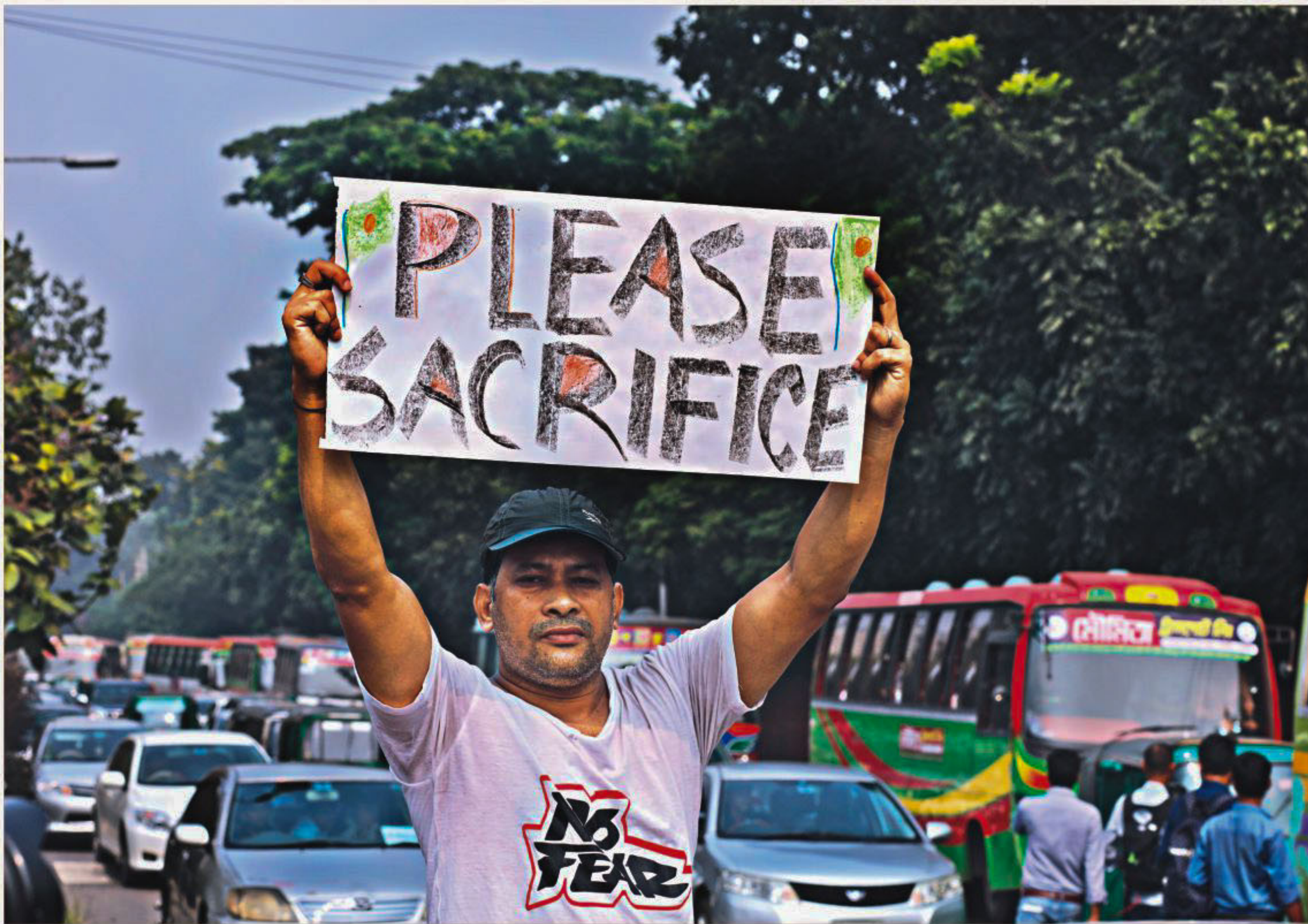
A man holds up a placard urging political parties to be accommodating in front of the Gono Bhavan yesterday during talks between Prime Minister Sheikh Hasina and Jatiya Oikyafront leaders.