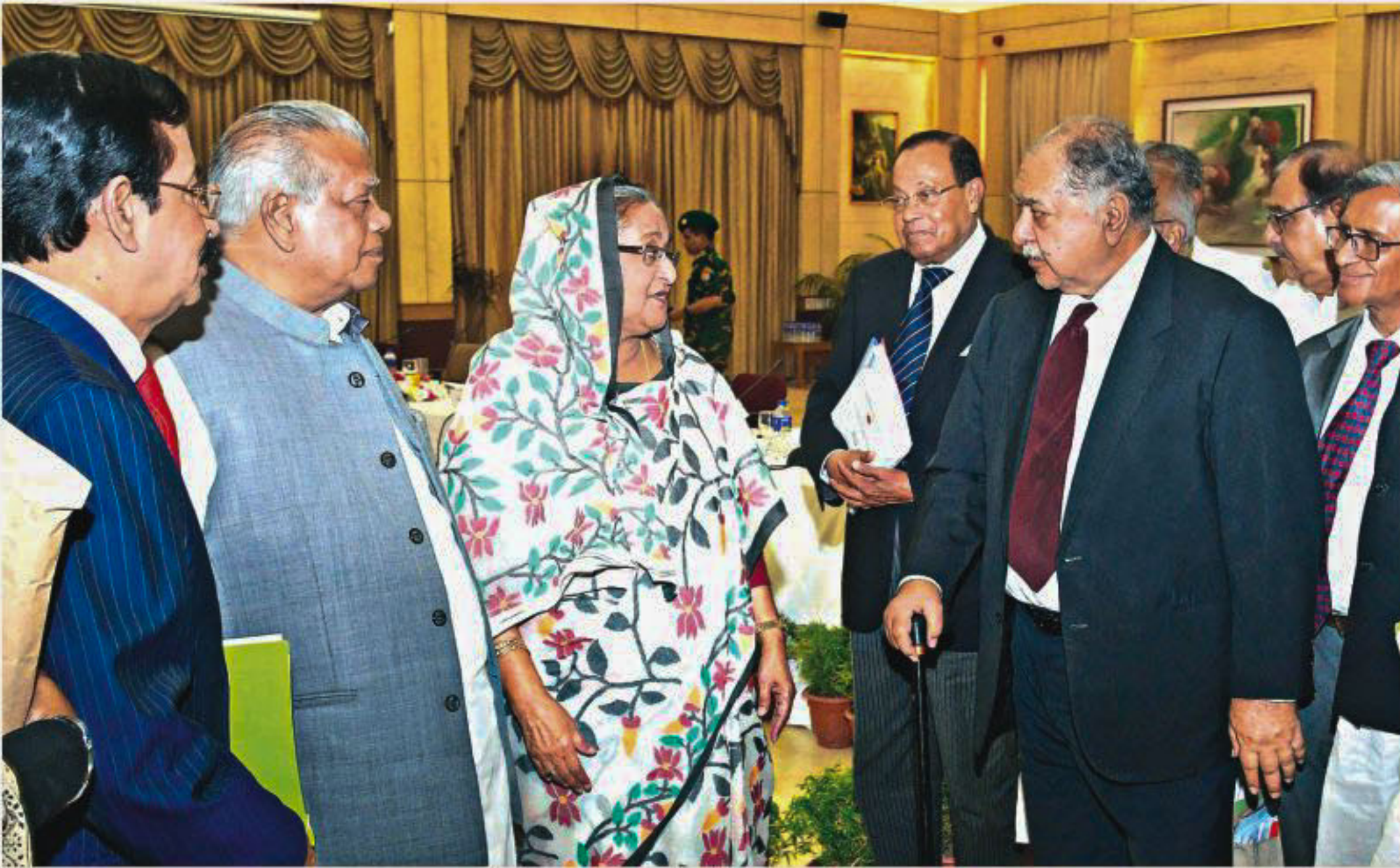
Prime Minister Sheikh Hasina and Jatiya Oikyafront leader Dr Kamal Hossain exchange pleasantries after yesterday's talks at the Gono Bhavan.

The Oikyafront leaders threatened that they would realise their demands if the government refuse to budge. They are also planning a march towards the Election Commission should it announce the election schedule, which is expected today, before the stalemate is over.