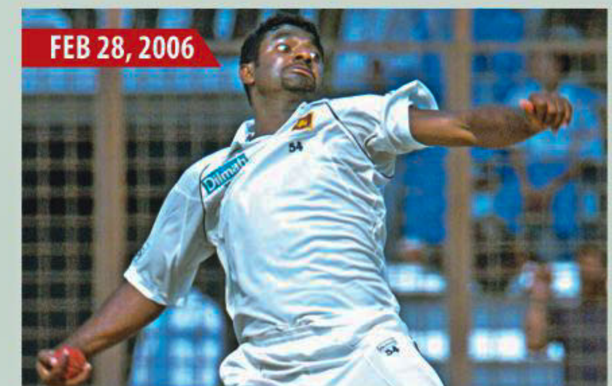
In 2006, the Zahur Ahmed Chowdhury Stadium hosted its first Test, between Bangladesh and Sri Lanka. The visitors won, again by eight wickets.