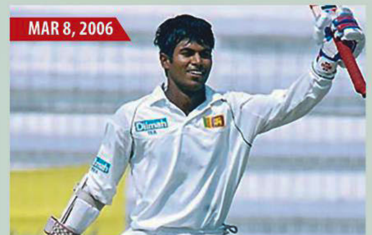
The Shaheed Chandu Stadium in Bogura has hosted only one Test, between Bangladesh and Sri Lanka in 2006. The visitors won that match by 10 wickets.