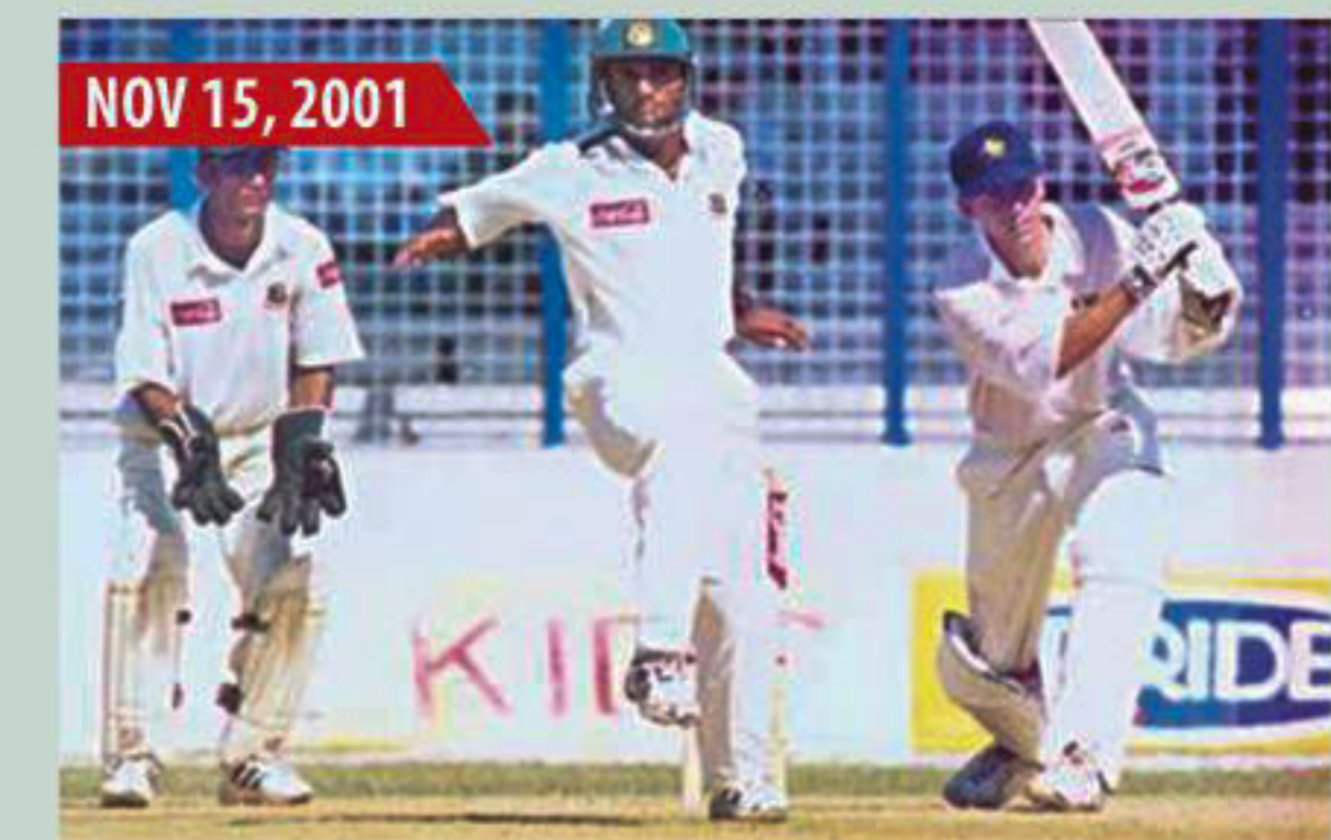
Bangladesh played Zimbabwe a year later at the MA Aziz Stadium's inaugural Test in Chattogram. It was another loss for the hosts, this time by 8 wickets.