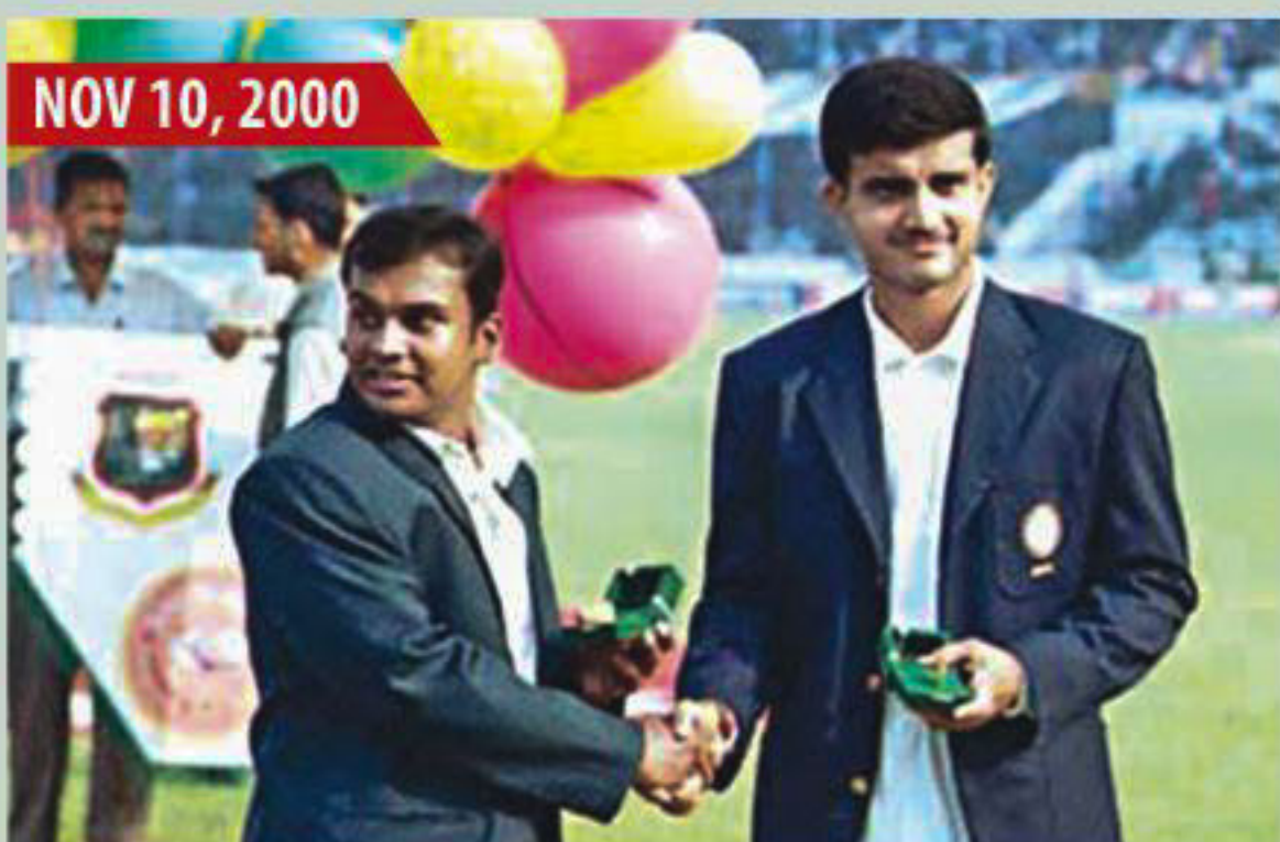
While it hosted its first Test in 1999, Bangladesh's maiden Test was held at the Bangabandhu National Stadium against India. The visitors won by 9 wickets.