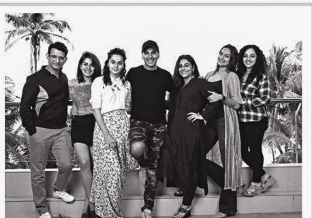
View More on Instagram