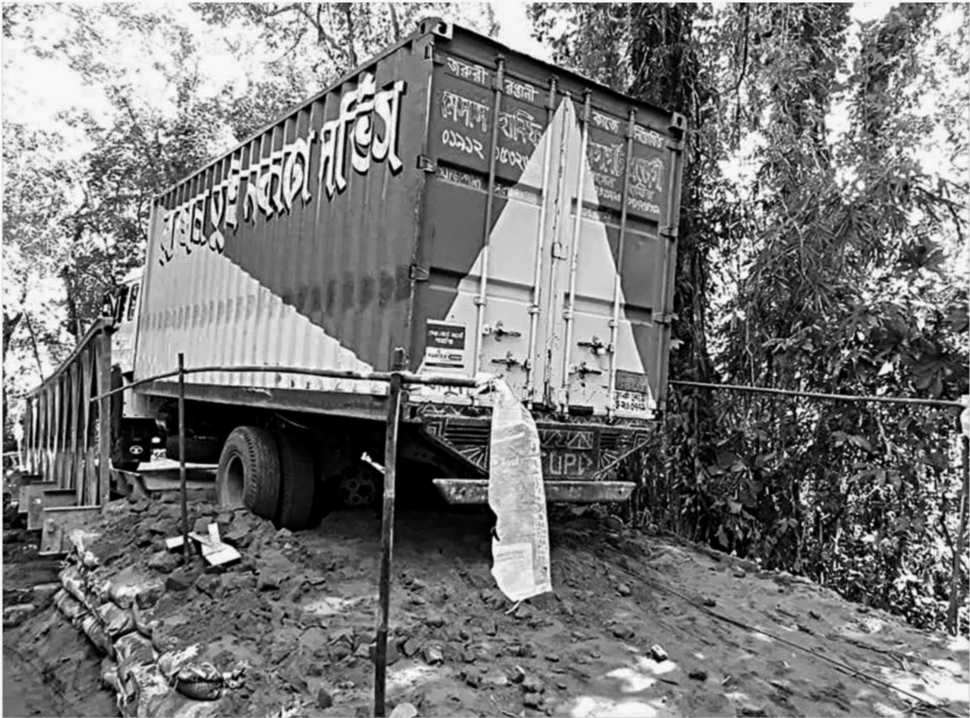
This Bailey bridge in Lawacherra forest area of Sreemangal upazila in Moulvibazar caved in under the pressure of a coal-laden truck early Thursday. Road communication with adjacent Kamalganj upazila remained suspended since then as the repair work could not be complete as of yesterday evening.