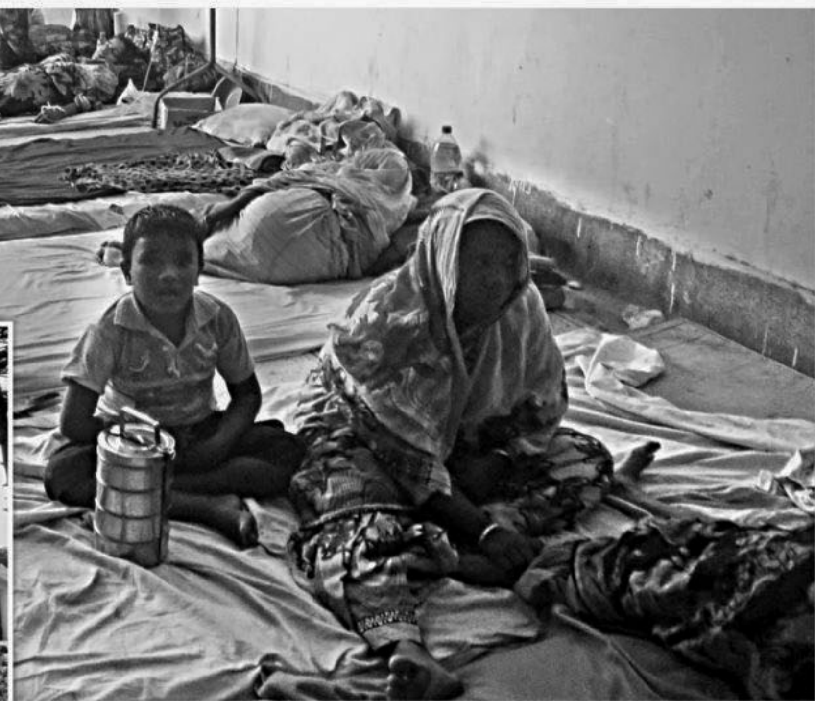
The photo taken a few days ago shows patients lying on the floor of General Hospital, Kurigram due to shortage of beds. Inset, front view of the hospital.