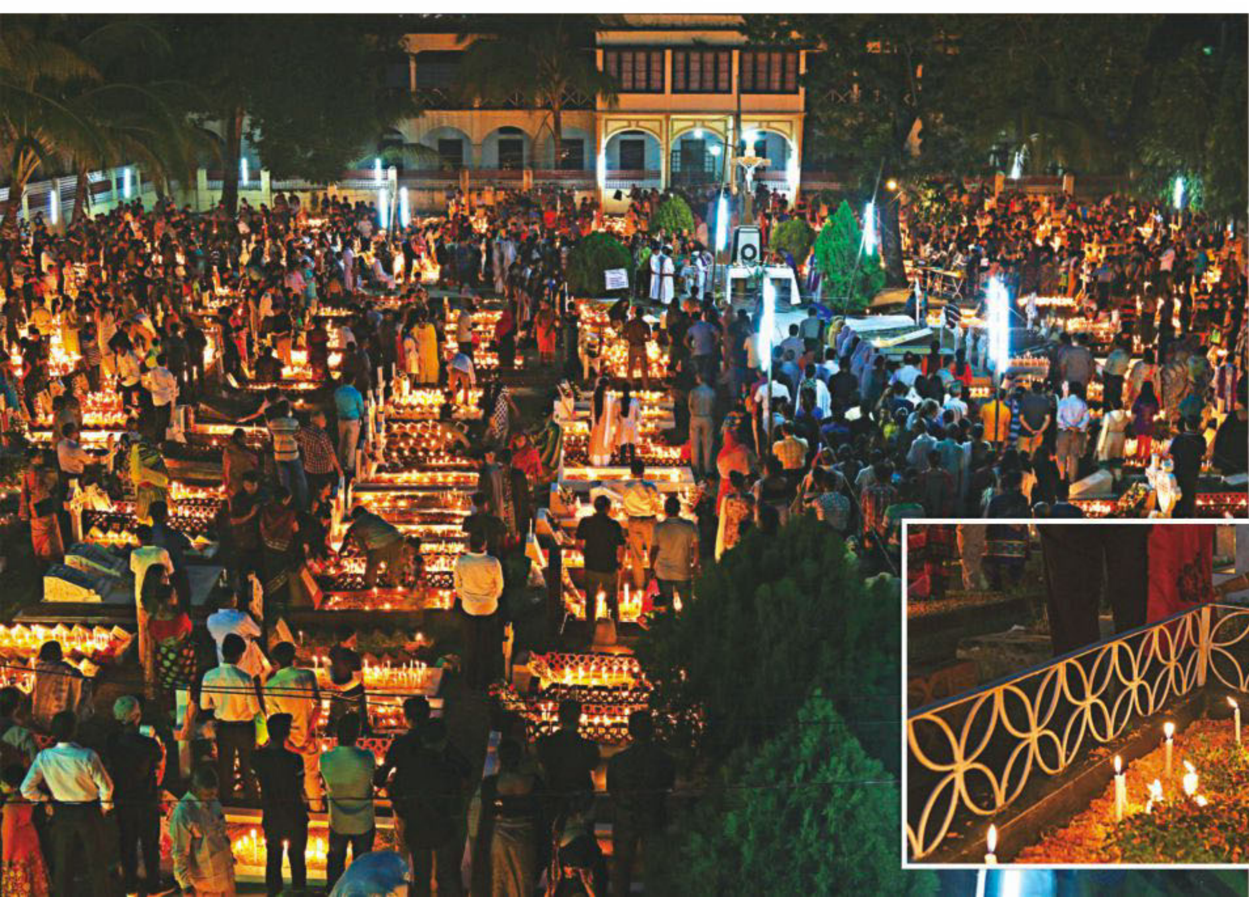
Christians observe All Souls Day to remember the deceased relatives at Patharghata Catholic Church in Chittagong city last evening. Inset, a girl lights up a candle on the church premises in memory of a loved one.