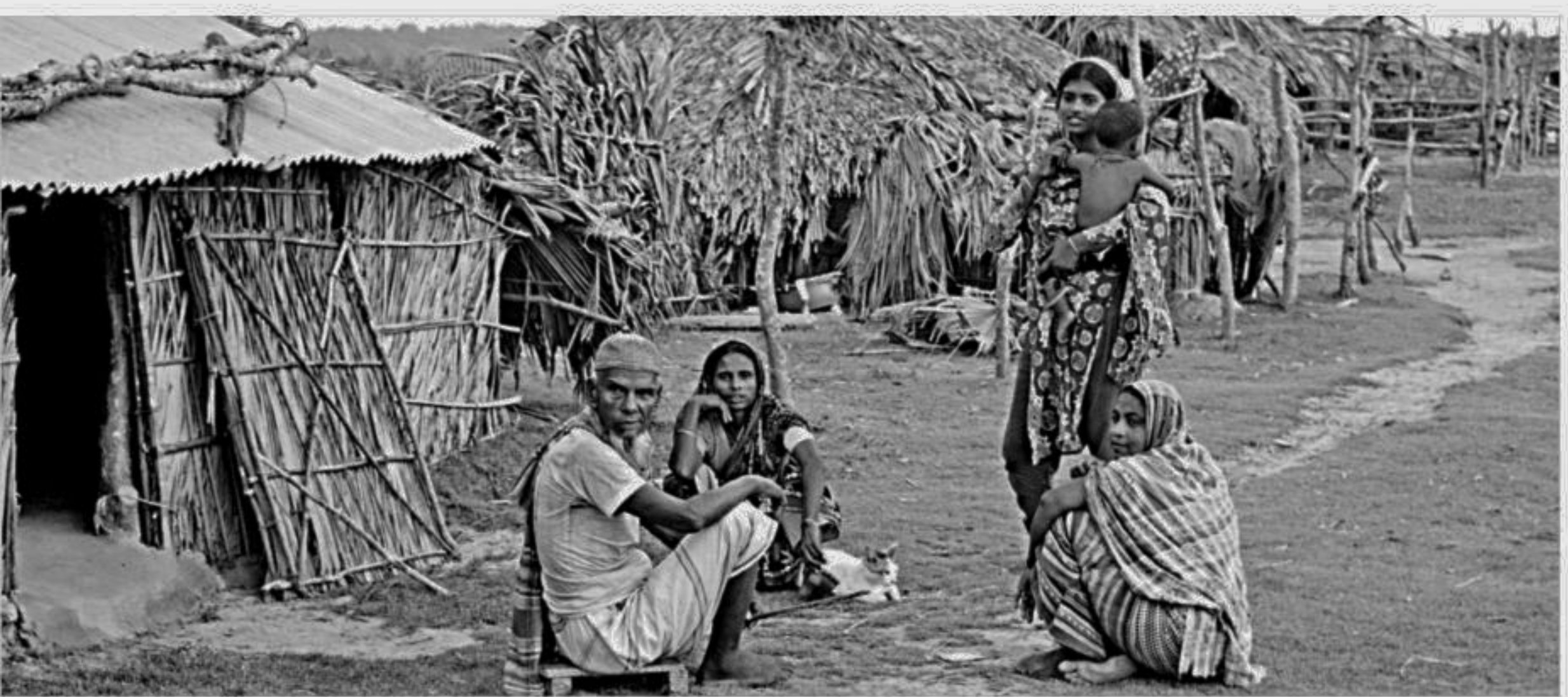
People living in shanties in eight coastal islands of Patuakhali's Rangabali upazila remain highly vulnerable during natural disasters like storms and tidal surges in absence of cyclone shelters. The photo was taken at Char Kashem.