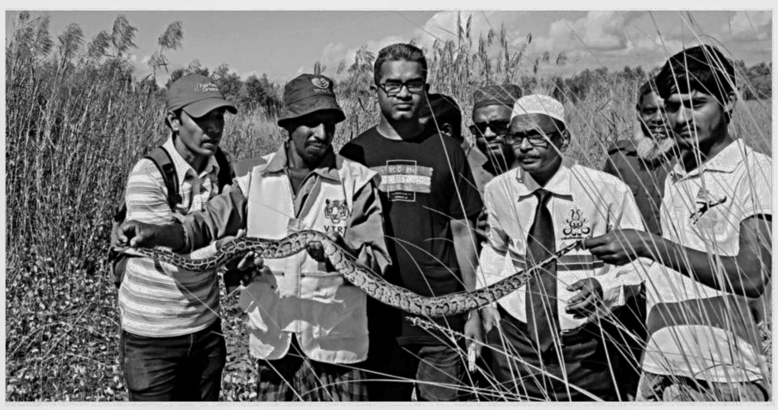
This six-foot-long python found in a fishing net in the sea near Barguna's Taltali upazila on Wednesday noon, was released in a nearby reserve forest of Pathorghata after rescuers of the reptile informed forest officials yesterday.