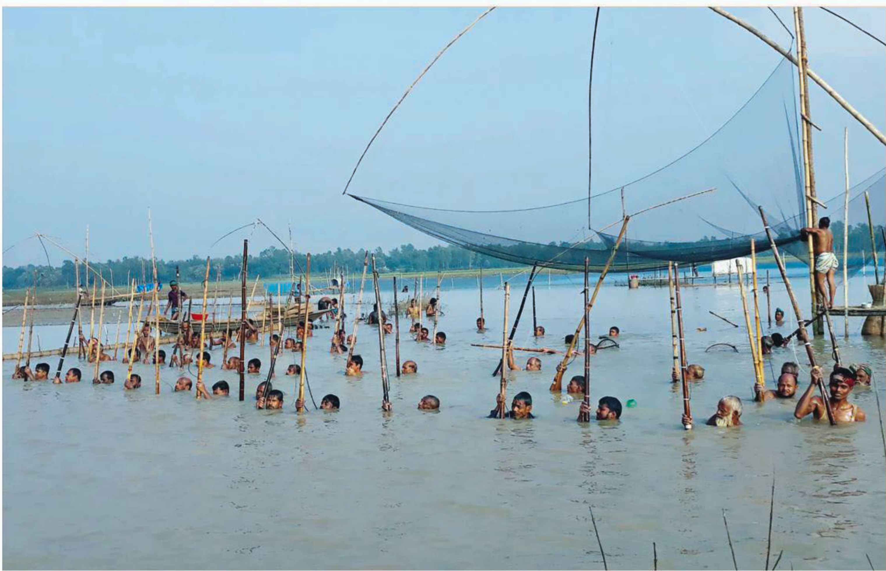
Villagers take part in a traditional fishing festival in Shail Sindur canal using handmade tools of bamboo in Sakhipur upazila of Tangail last week.