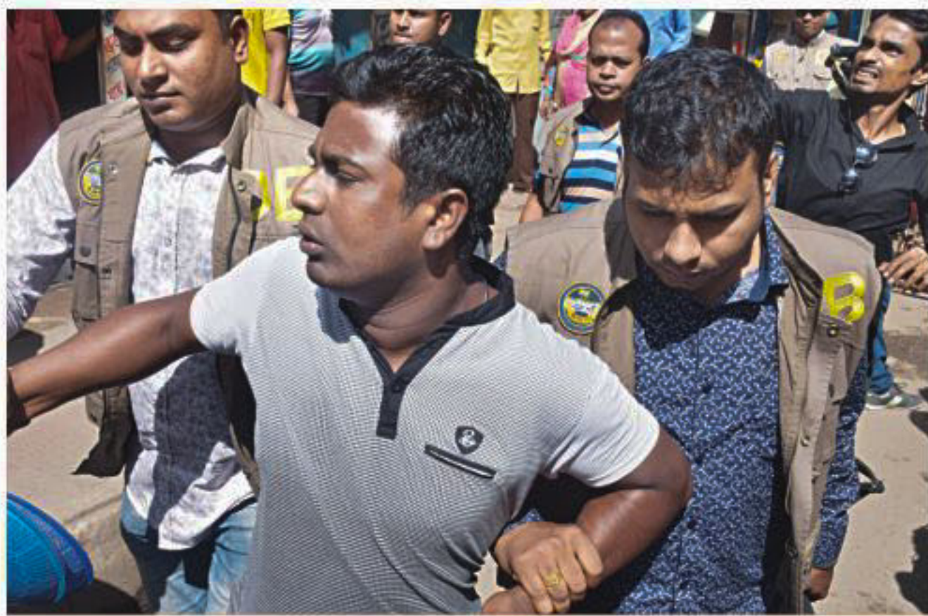
A BNP activist being dragged into a pickup on Sadar Road in Barishal city yesterday afternoon. Five leaders and activists of the party were arrested when they formed a human chain and brought out a procession to protest a court verdict that convicted their party chief Khaleda Zia.