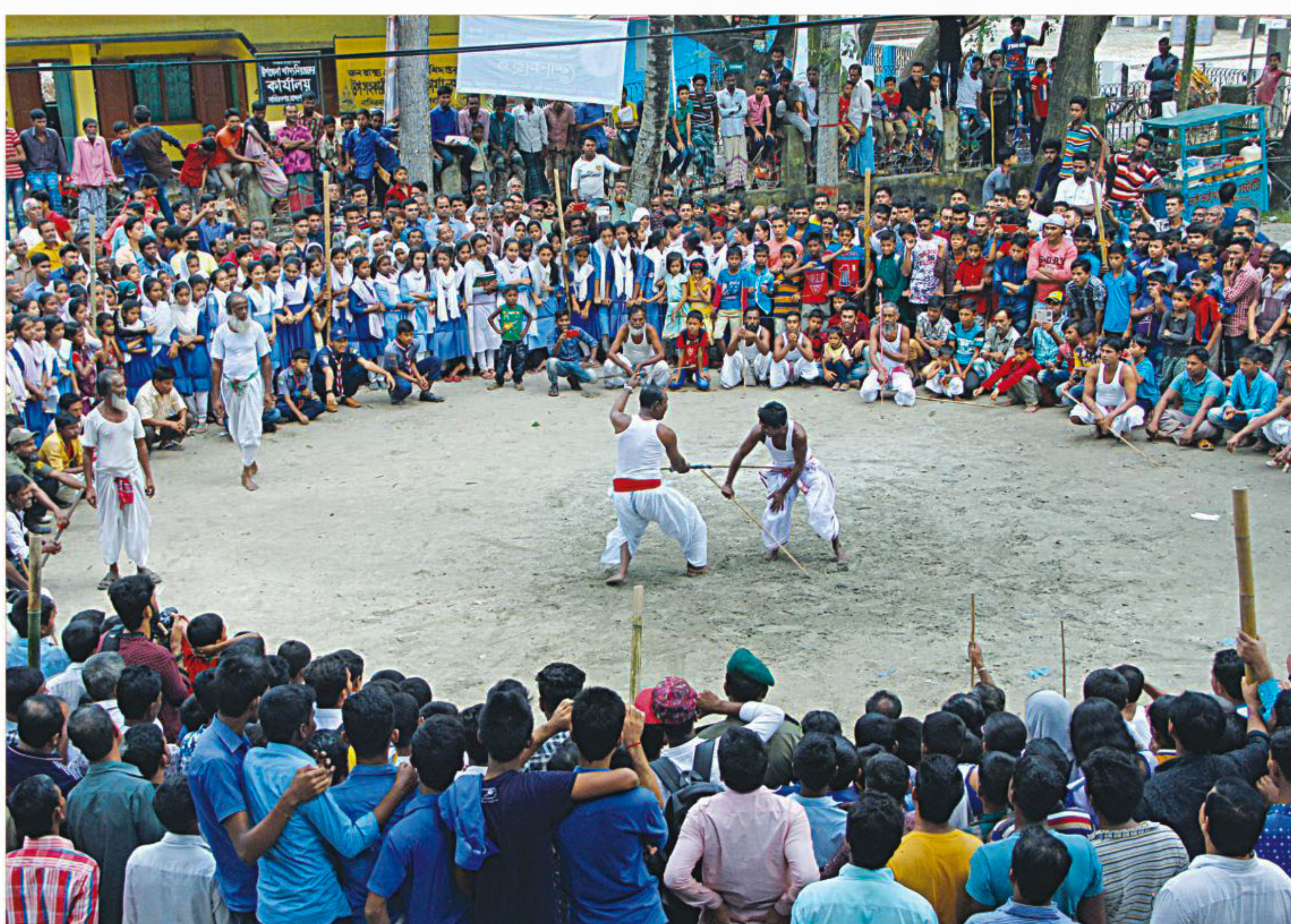
People enjoy "Lathi Khela", a traditional martial art of rural Bengal involving sticks, arranged on the Nasirnagar Upazila Parishad premises in Brahmanbaria on the occasion of Folk Fair yesterday. Eight teams from neighbouring Sarail upazila participated in the event.

The parents of the girls filed a case in this regard.