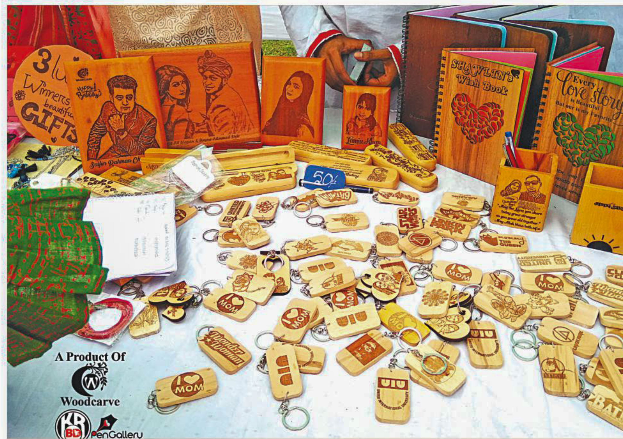
Wood Carve BD: Adding a hint of personal touch